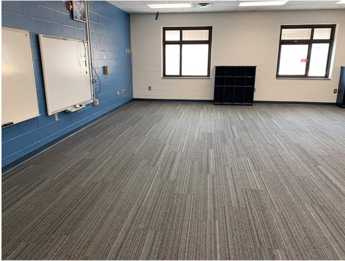
Carpet is installed in the relocated music room.