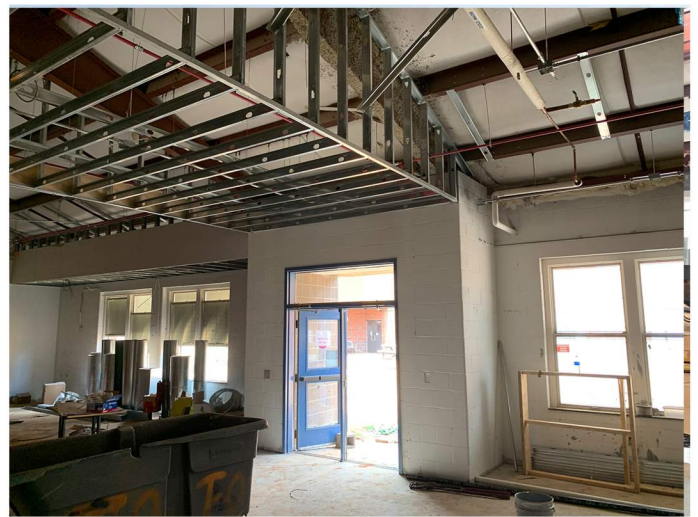
Soffit / ceiling construction is in progress in the new Media Center.