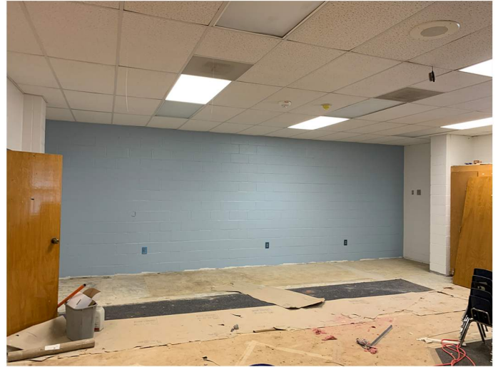
Finishes are in progress in the revised Kindergarten classrooms.