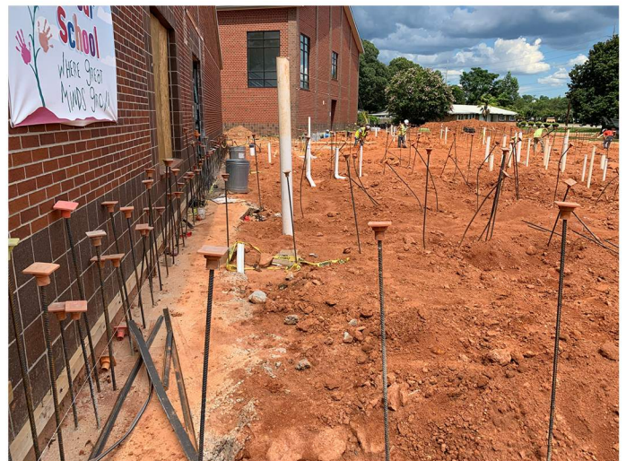
Underground plumbing is nearly complete.