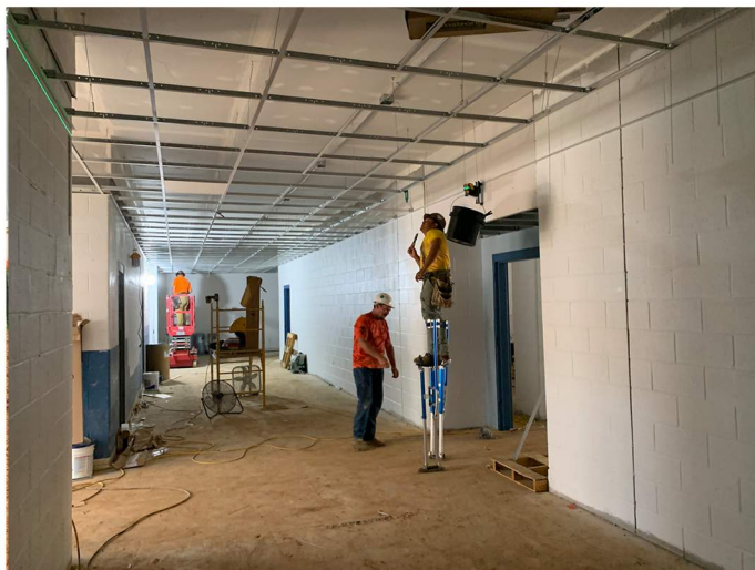
Ceiling installation is in progress in the renovated corridor.