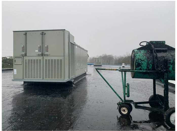
The main roof is dried in and mechanical units are set.