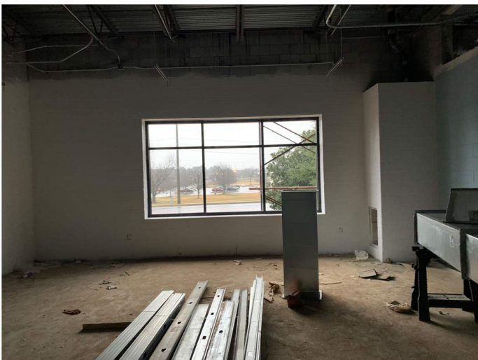
Storefront installation has begun.