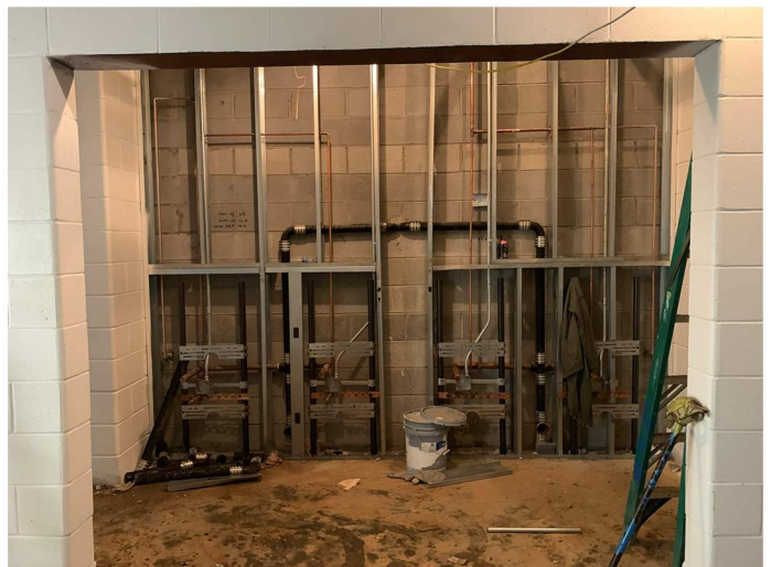
Plumbing rough-ins are largely complete.