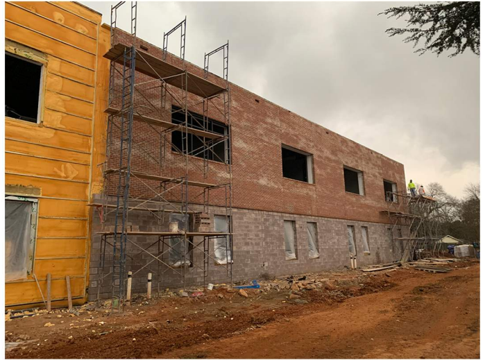
Masonry installation is in progress.