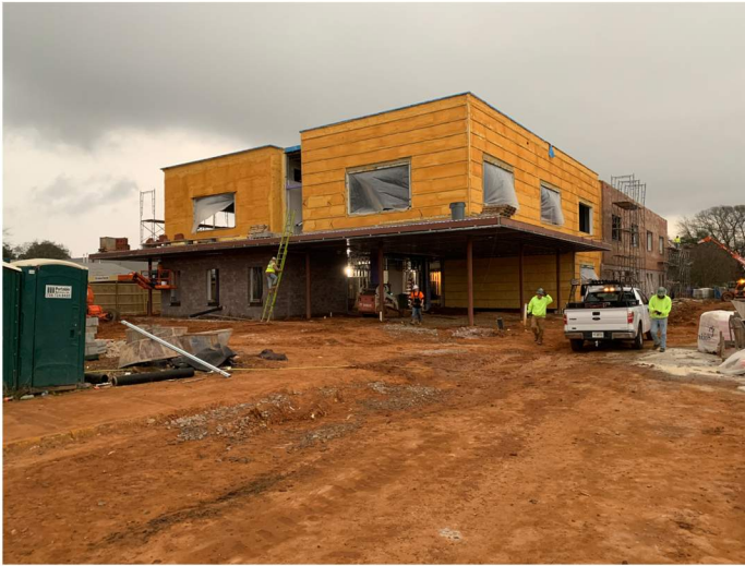
Exterior progress photo.