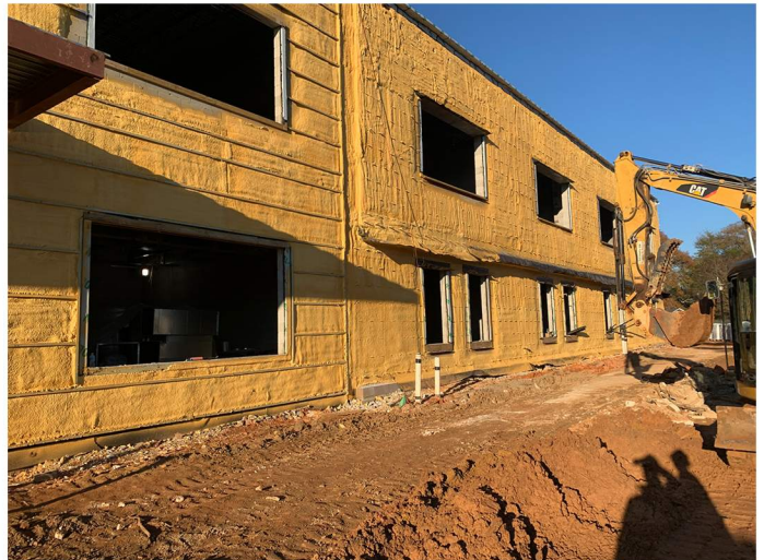
Exterior progress photo.