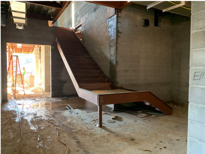
New steel stair has been set.