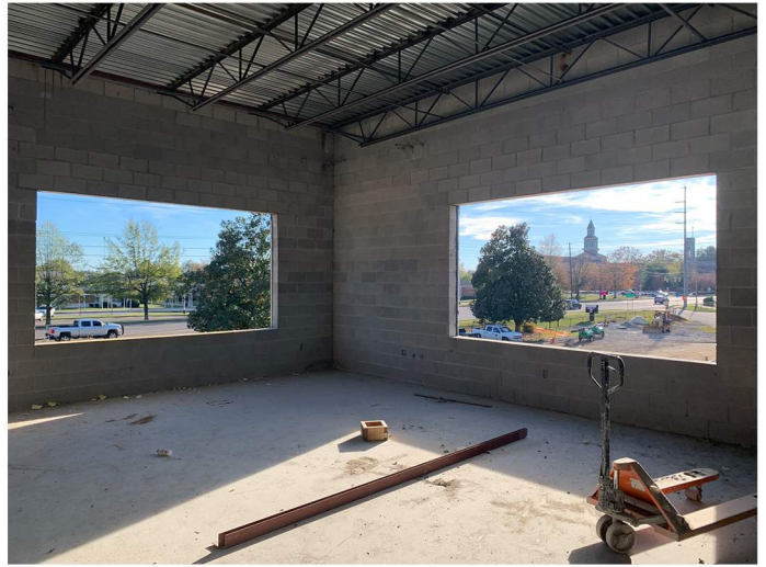
View of typical second level classroom.