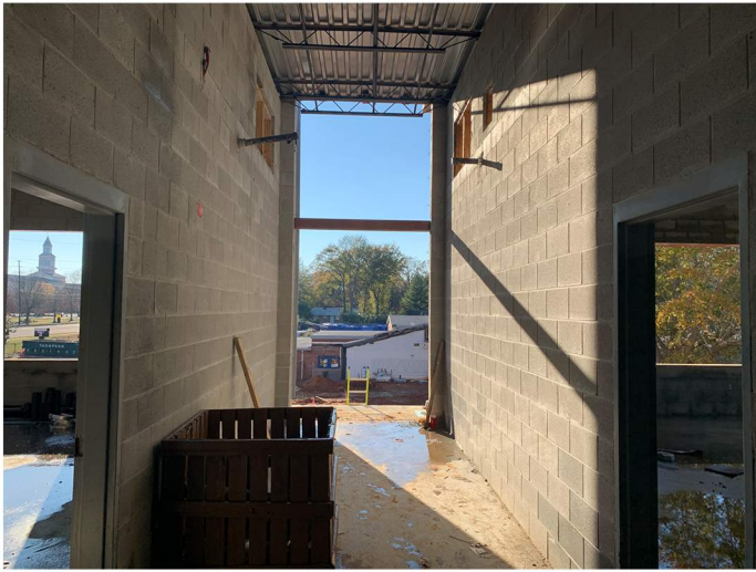
View of window in second level corridor.