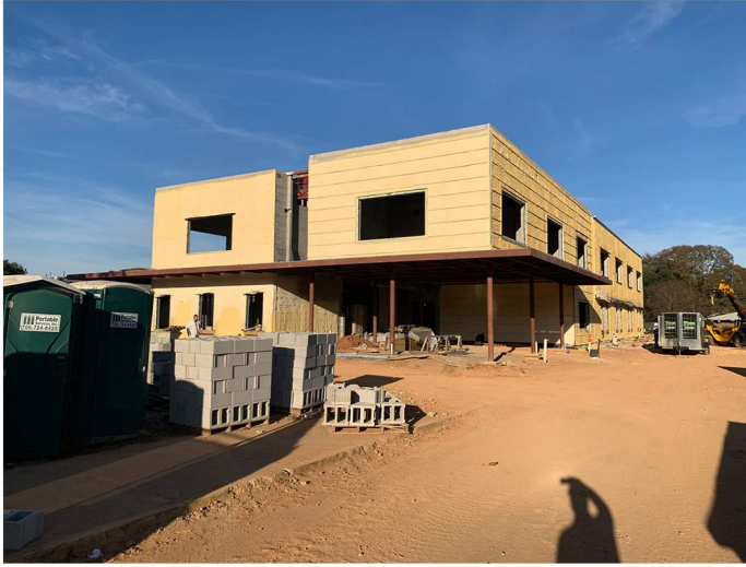
Exterior progress photo.