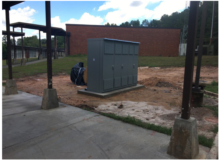
NEW ELECTRICAL SWITCHGEAR