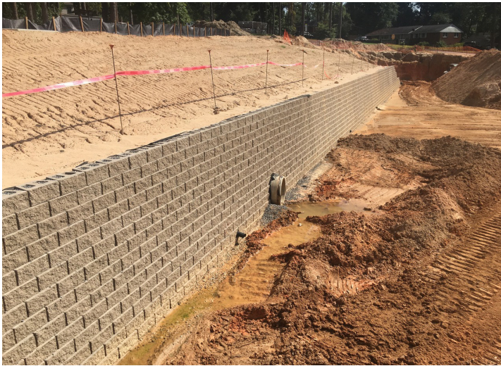
EXPANSION OF EXISTING DETENTION BASIN