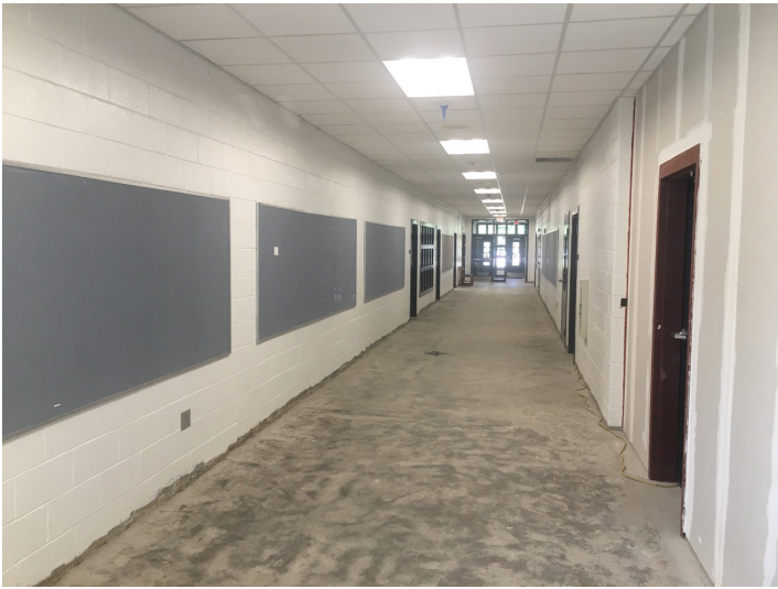
RENOVATION OF EXISTING ADMINISTRATION BUILDING