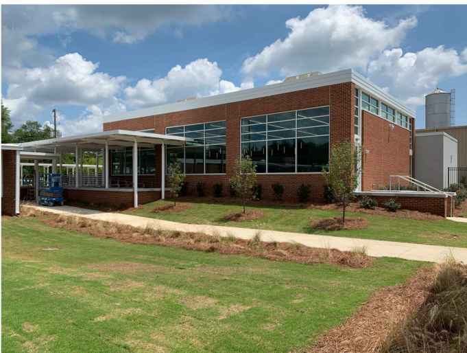
Side view of new cafeteria addition.