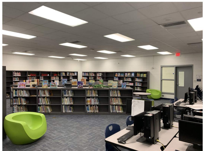
New furniture in media center.