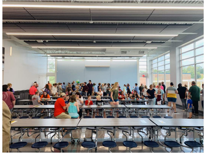
Ribbon cutting activities inside new cafeteria.