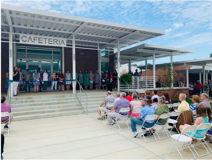
Ribbon cutting outside new cafeteria.