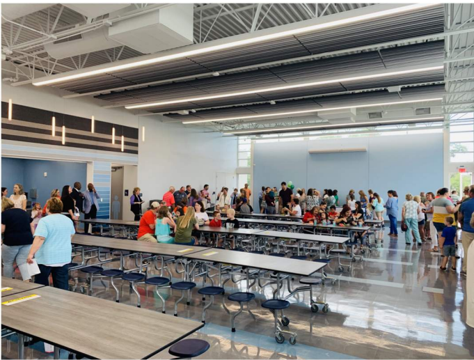
Ribbon cutting activities inside new cafeteria.