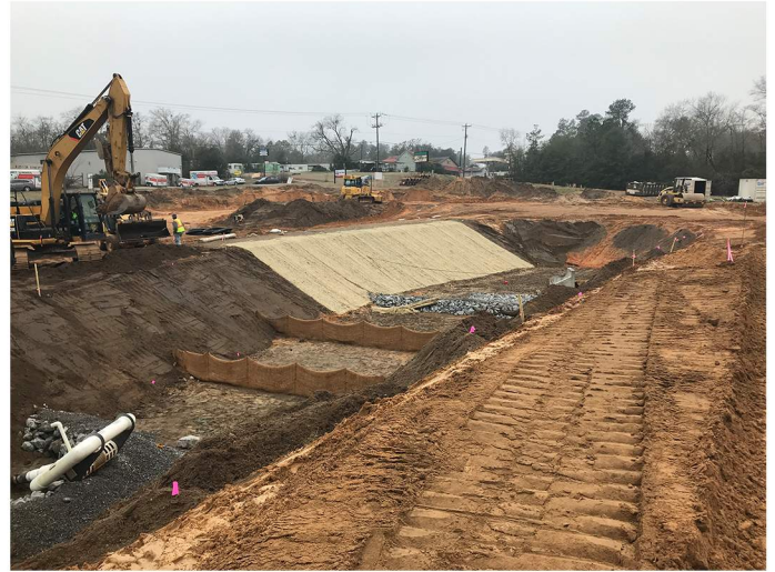
Grading for new stacking drive and drainage is in progress