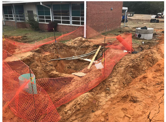
Installation of new site utilities is largely complete