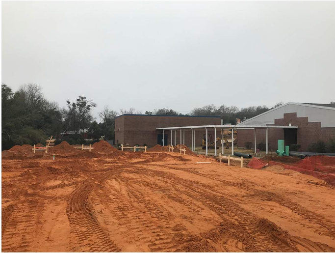
Building pad prep is underway