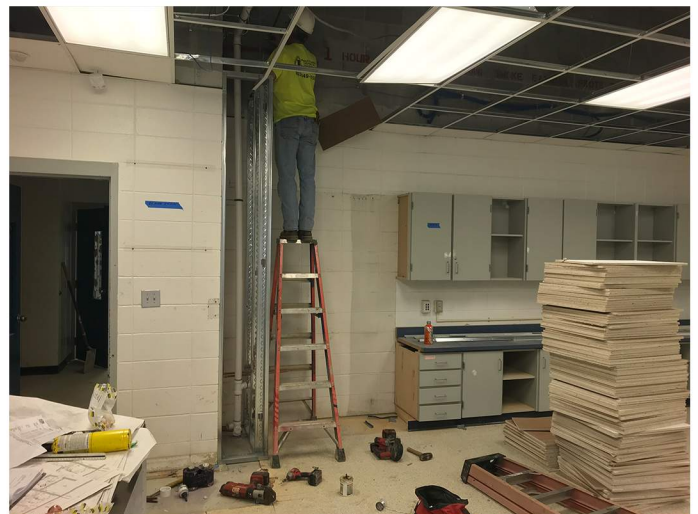
New wall framing is in progress