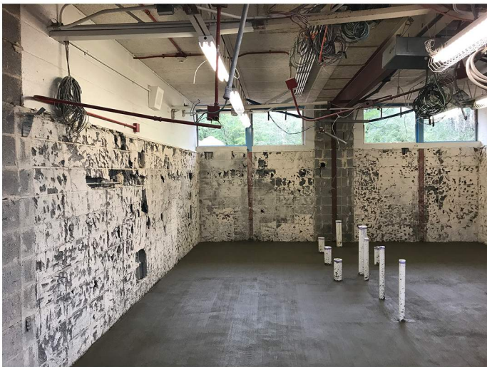
New plumbing infrastructure and concrete slab