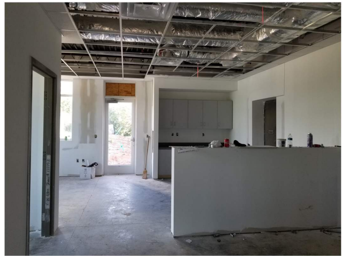
Progress photo of administration addition interior.