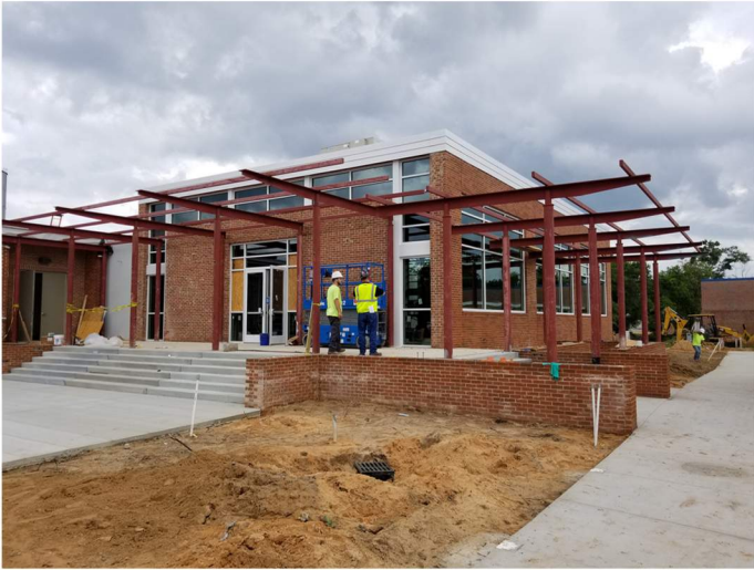
Progress photo of cafeteria addition exterior.