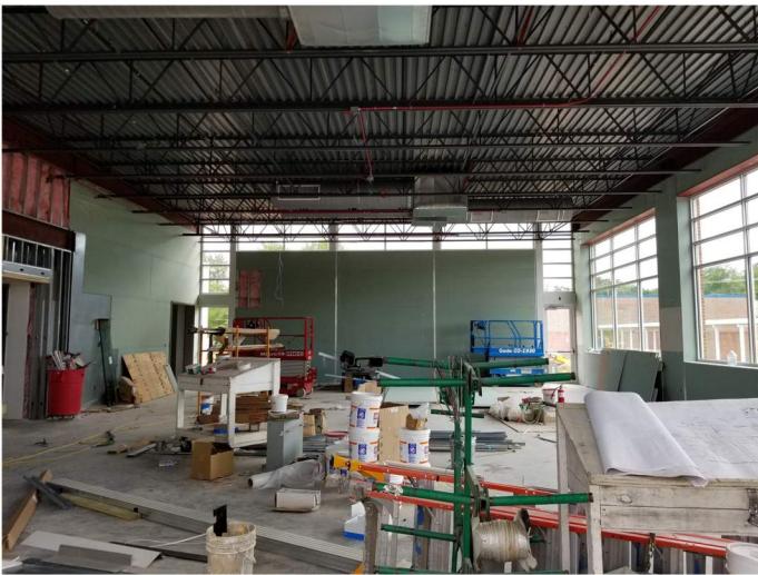
Progress photo of cafeteria addition interior.