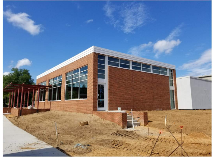
Progress photo of cafeteria addition exterior.