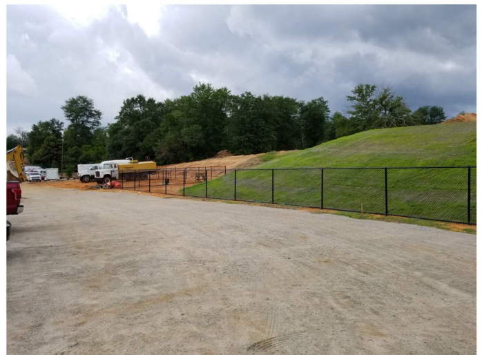
Site paving preparation and exterior fencing installation.