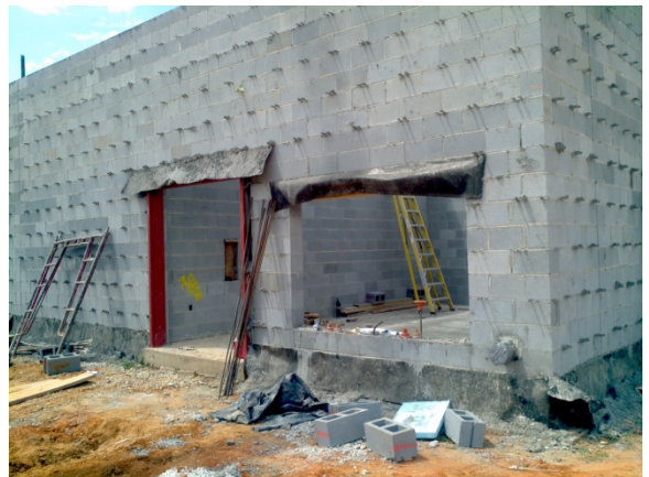
Flashing at masonry openings and at floor level.