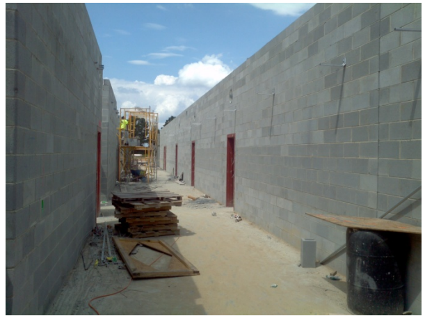
Block work in corridors in Area A is being topped out.