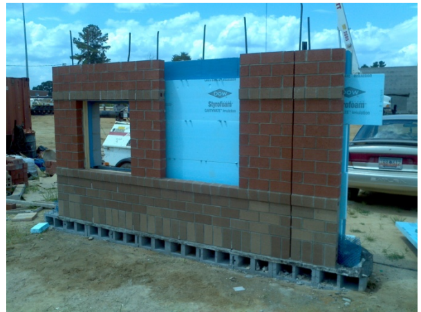
Masonry sample panels for review and approval.