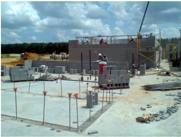
Completed slab in Area B and block work underway.