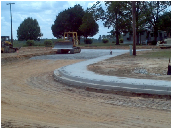
New bus drive and perimeter walks schedule to be completed before start of 2013 school year.