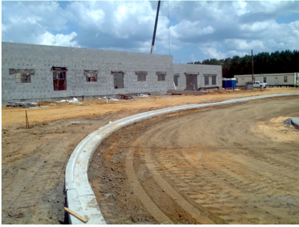
Curb and gutter at new bus drive.