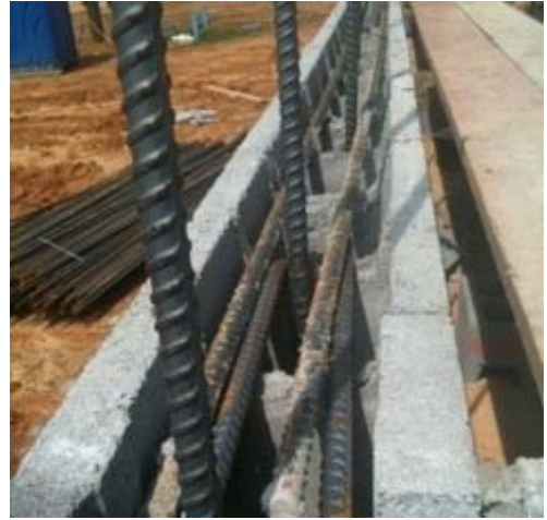
Block work continues