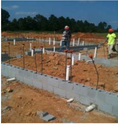
Area C Plumbing rough-in in kitchen