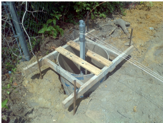
Forming concrete bases for new site lighting