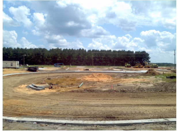
New bus loop and new parking lot