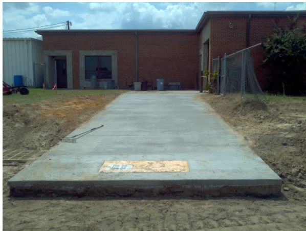
New walk to provide access to existing Ag. Shop