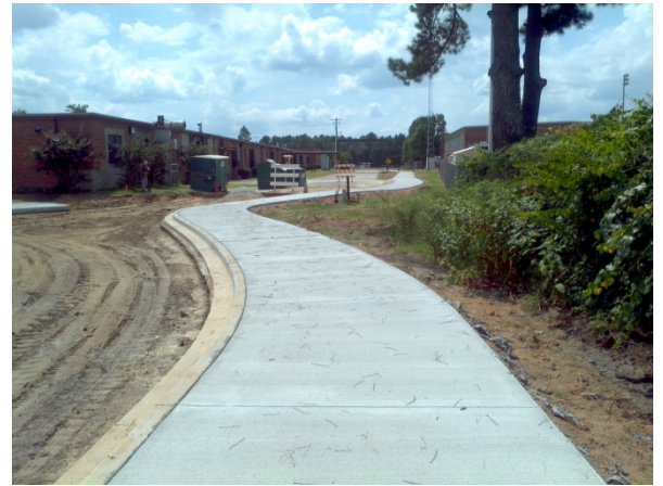
New walks connecting the new buss drive to existing high school.