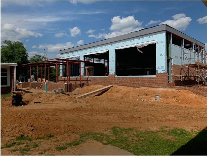
Brick installation is in progress on the cafeteria addition.