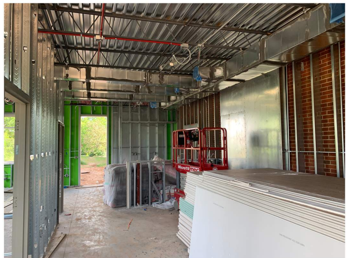
Progress image of administration addition interior.