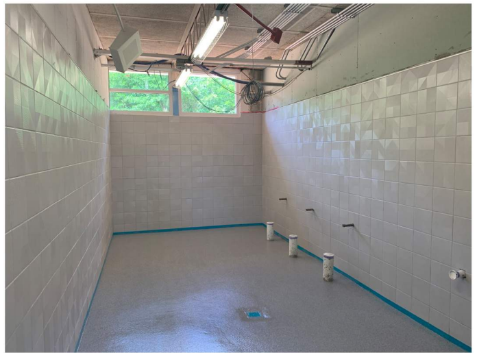
Epoxy and tile installation in renovated restrooms.