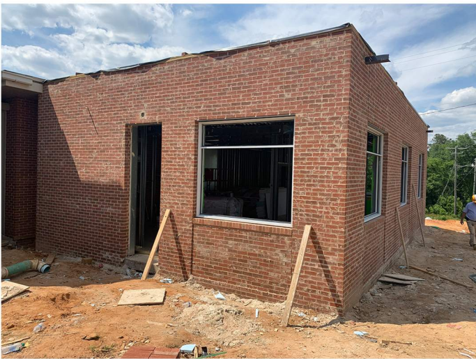
The administration addition exterior is largely complete.