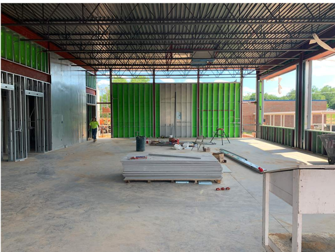
Progress image of cafeteria addition interior.