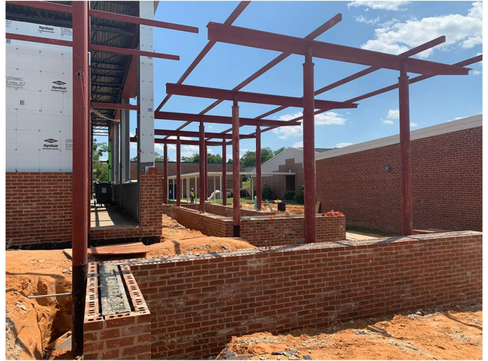
Site walls have been constructed to form area for ramps and stairs.