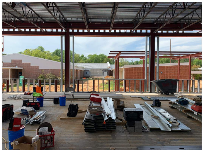
New window openings in cafeteria addition.