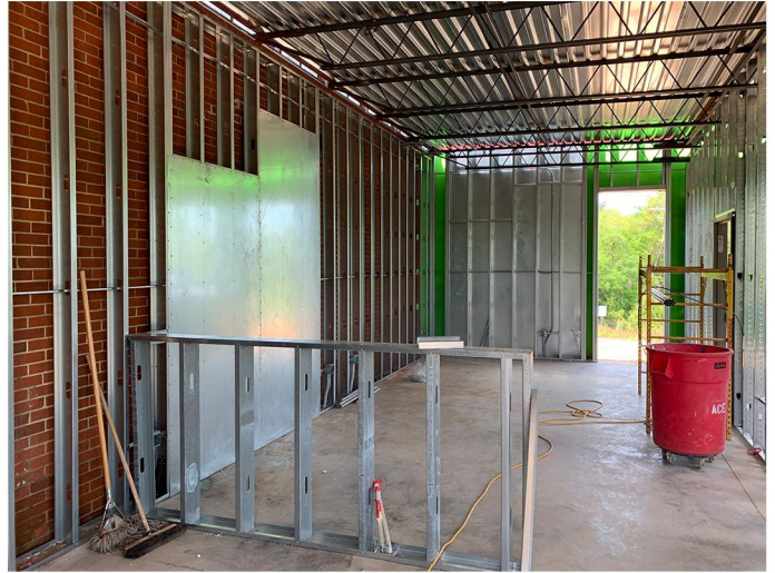
Interior framing in progress for foodservice administration addition.