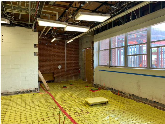
Slab prep work for new kitchen slab.