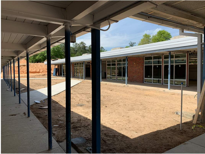
New storefront windows installed in Area 1.