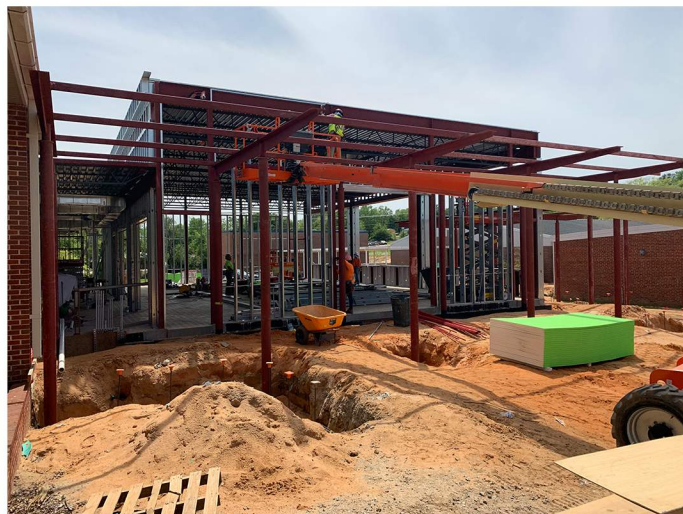
Framing is in progress for new cafeteria addition.