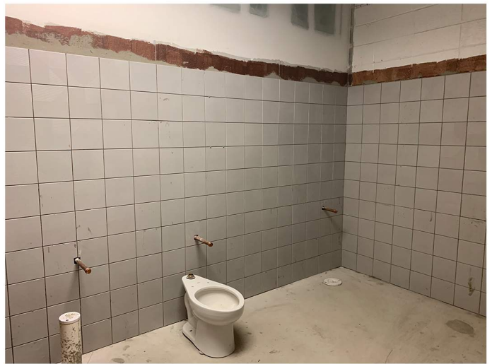
Wall tile installation is in progress in renovated restrooms.