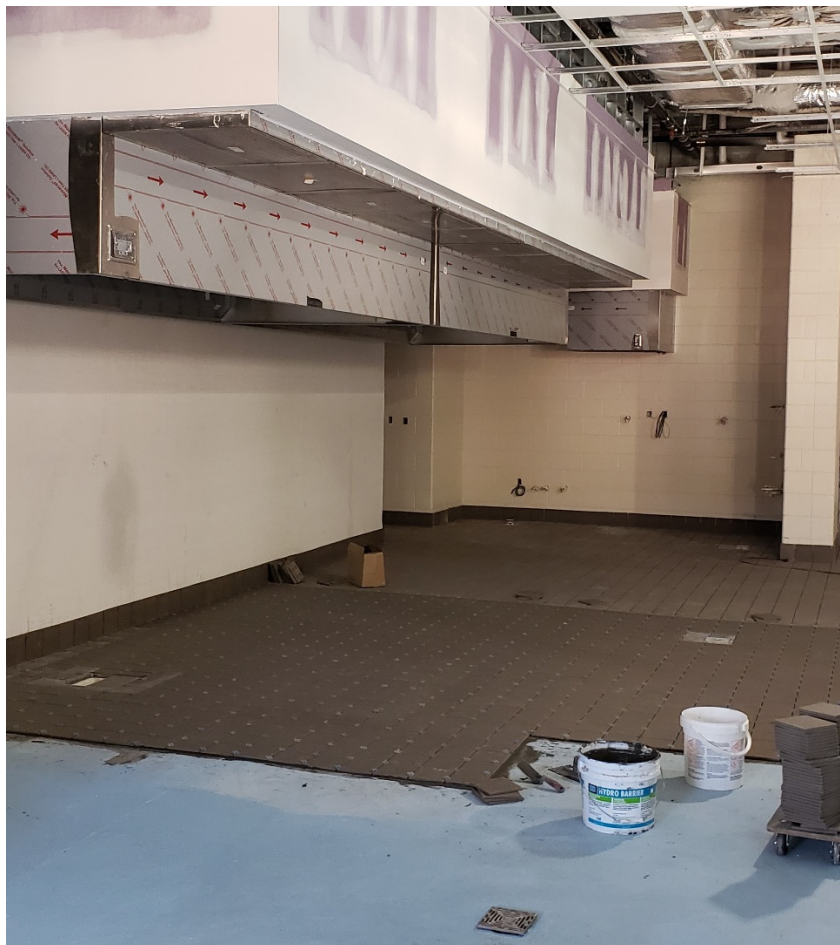
Painting and hard tile in Culinary area