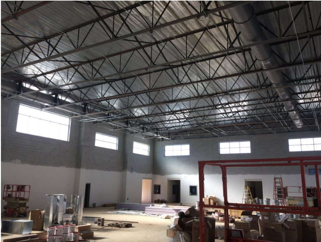
Glass windows in, some painting started and overhead rough-in continues in Gym