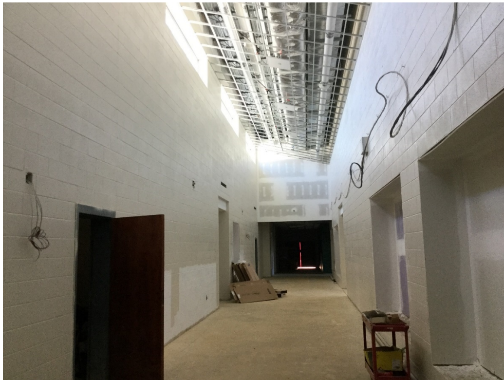
Recent ceiling grid installation along the ROTC/Band corridor