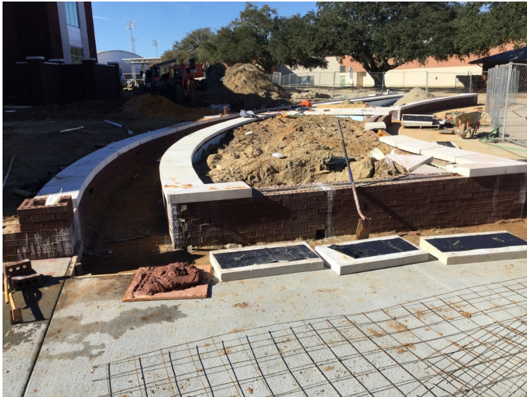
Completing planter precast at entrance