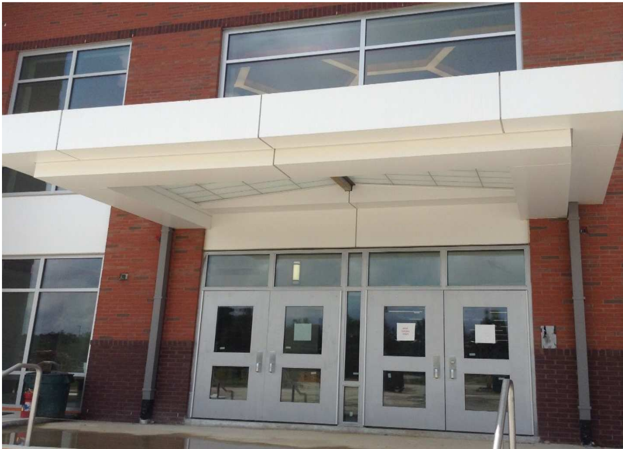
Main entrance canopy and translucent roof panels installed