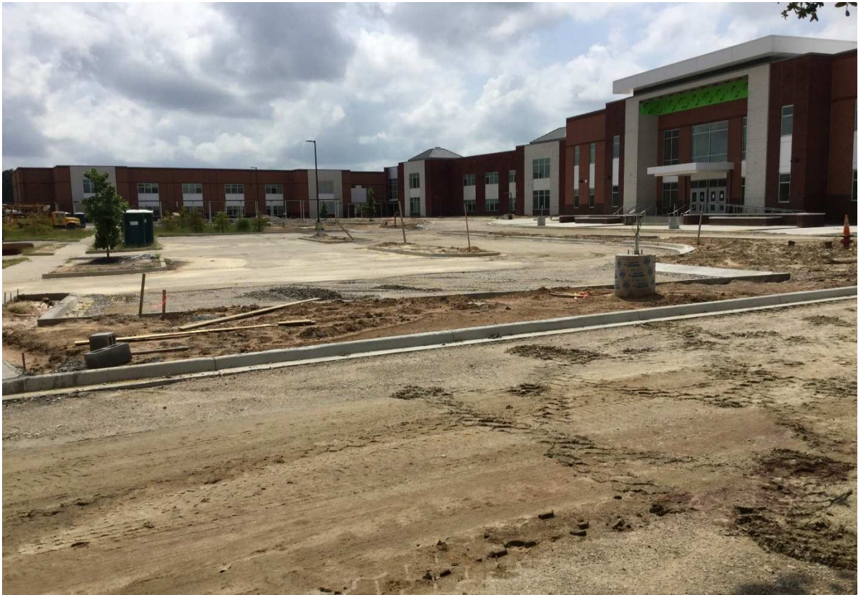
Curbs and canopy installed in front parking lot