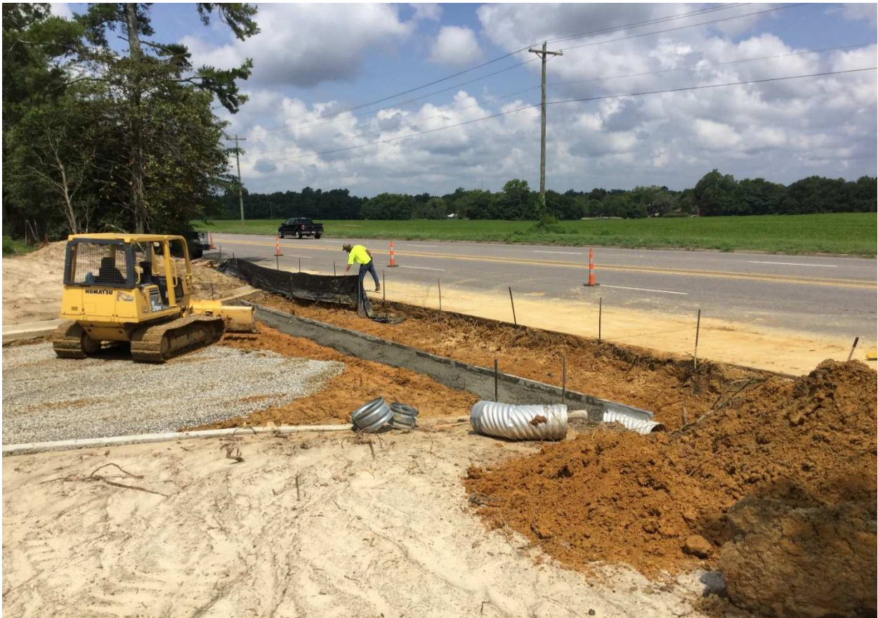
Installing drain across new entrance from Rutland Drive