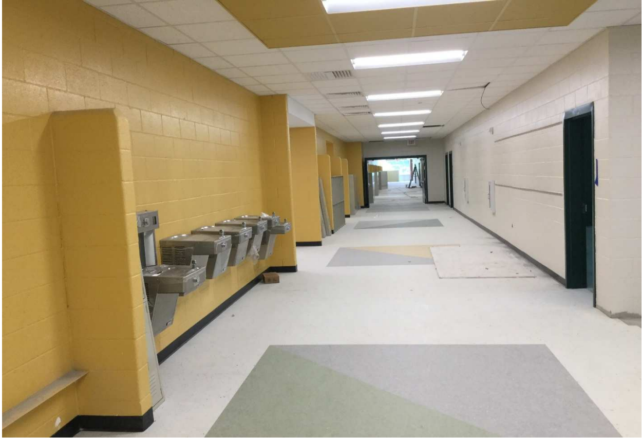
Flooring complete and lockers underway 2 nd floor classroom corridor