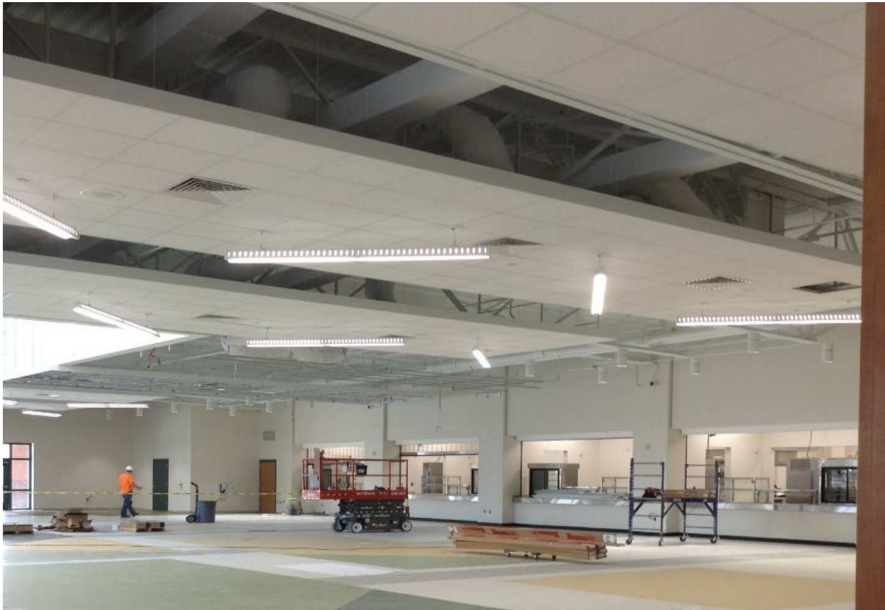
Cafeteria floor finishes near completion