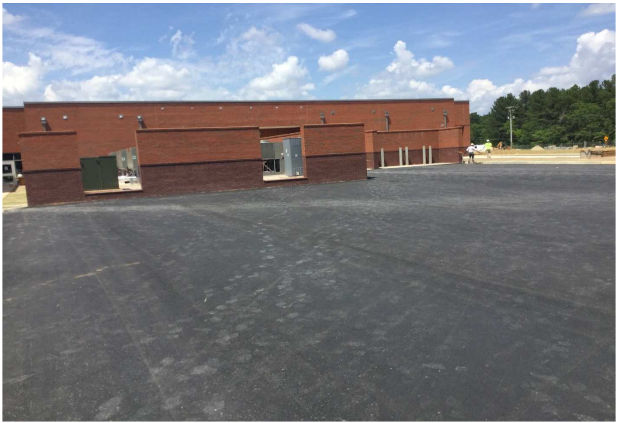
Asphalt pavement at loading dock area and bus loop road