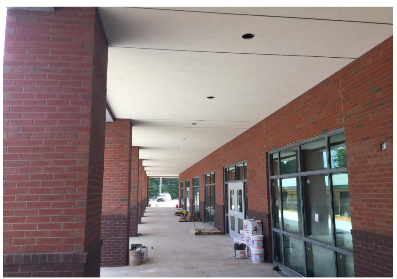
Ceiling and sidewalk finished along breezeway