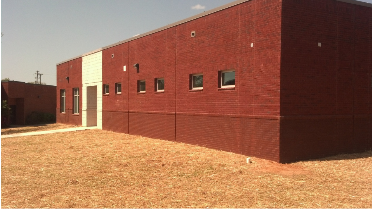
Field House Exterior