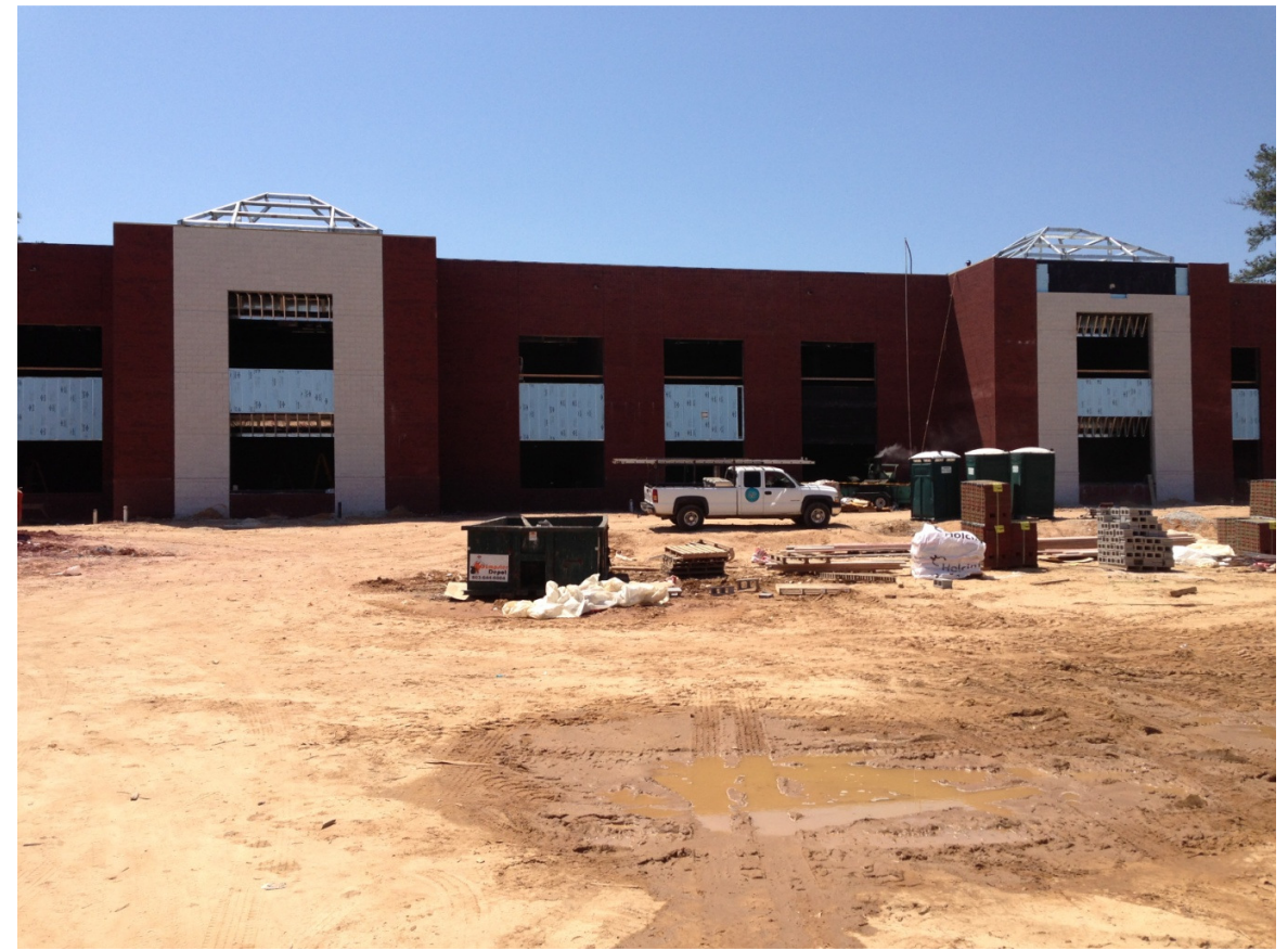
Science Building Exterior