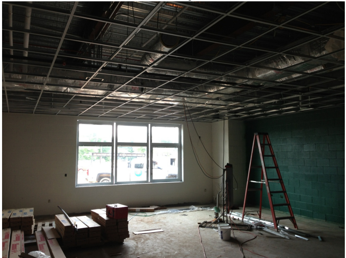
Science Building Classroom