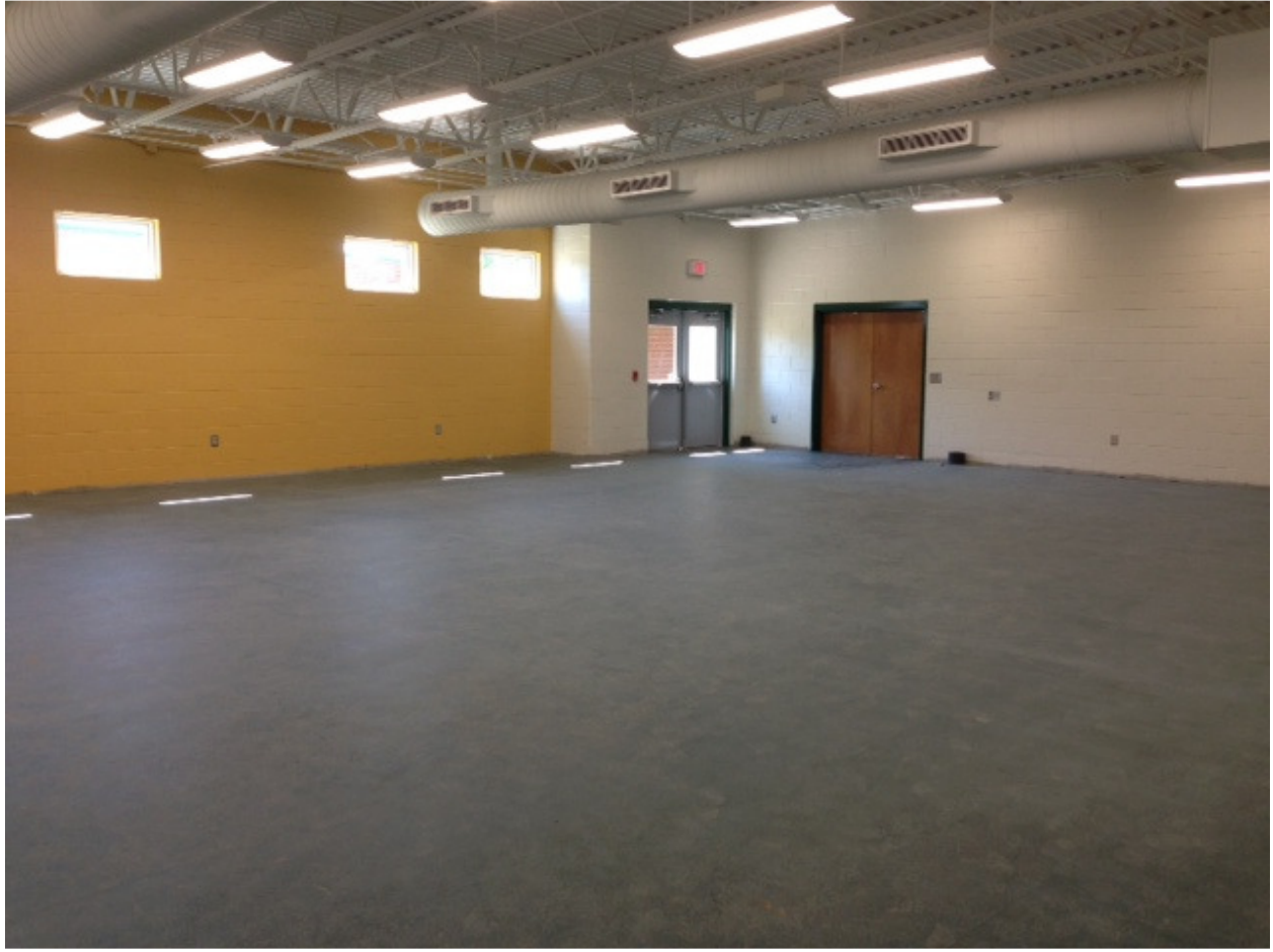
Field House Weight Room