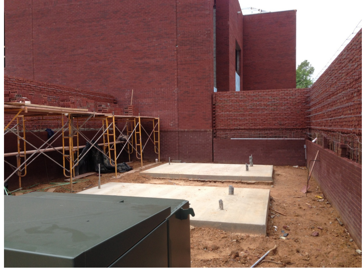
Screenwall at Science Building's Chiller