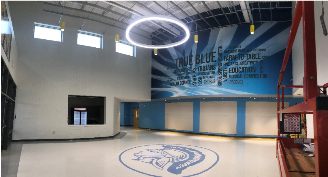
Area "D" – Gymnasium Lobby