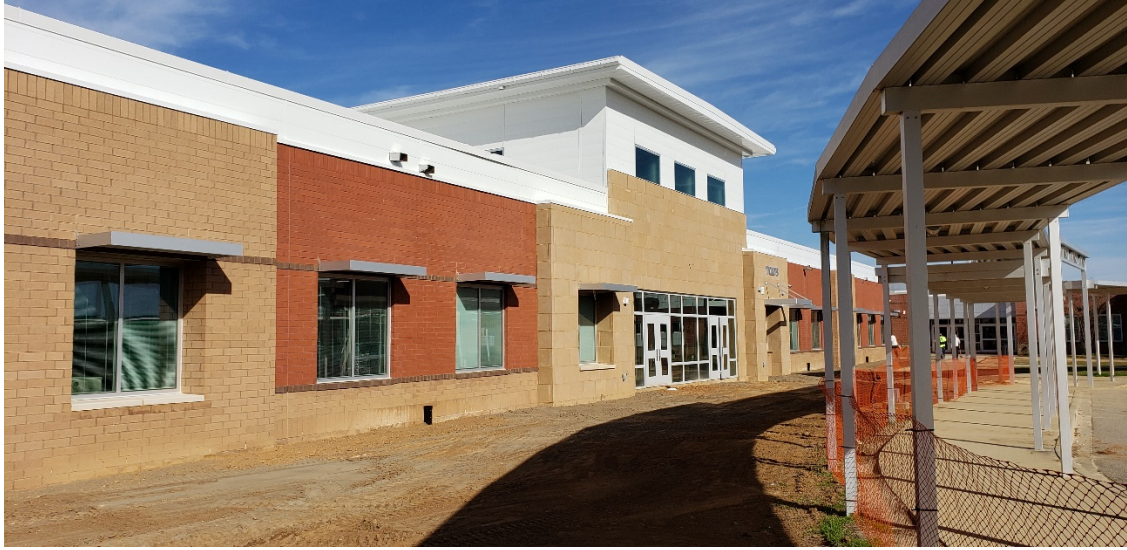
Gymnasium Building – Front Elevations