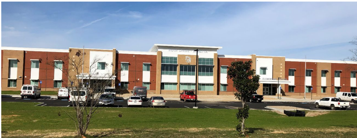
Main Building – Front Elevation