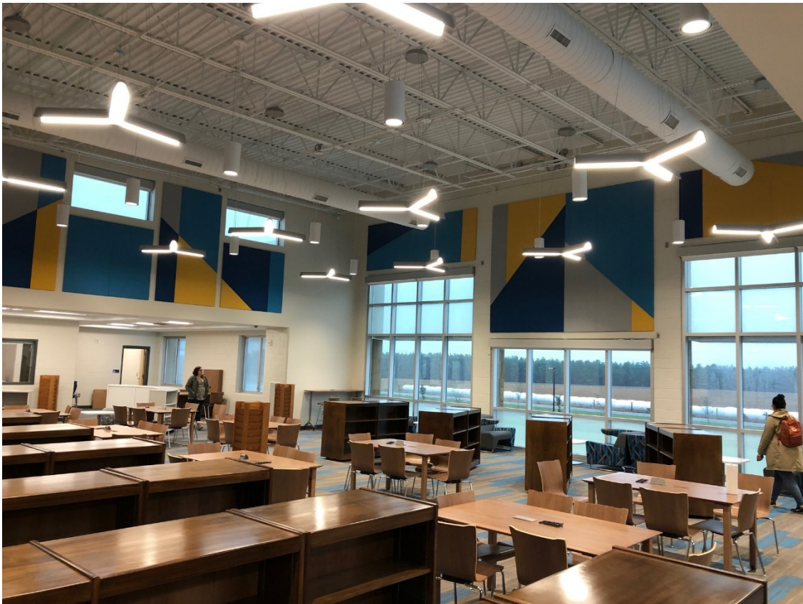
Area "A" – 2 nd Floor – Reading Room