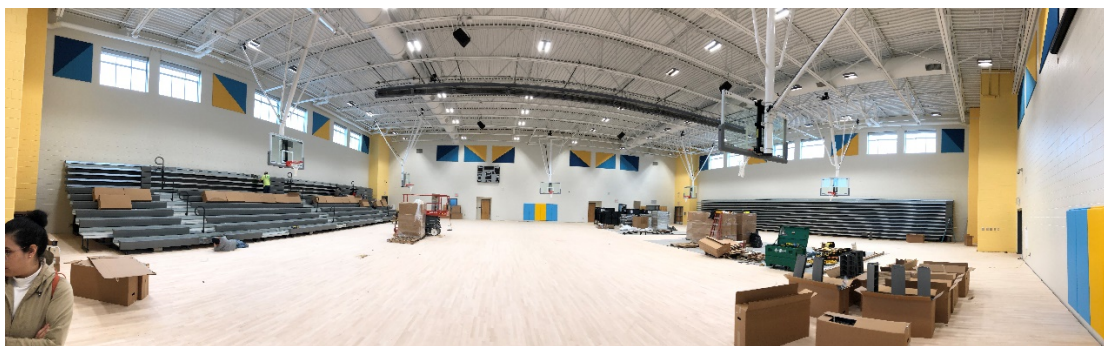
Area "D" – Main Gym