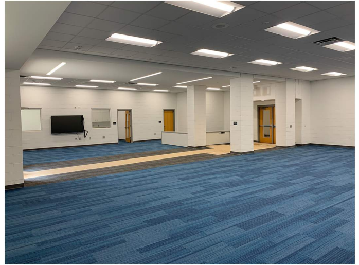
Image of completed media center.