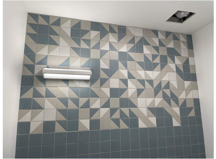
Typical restroom progress photo.