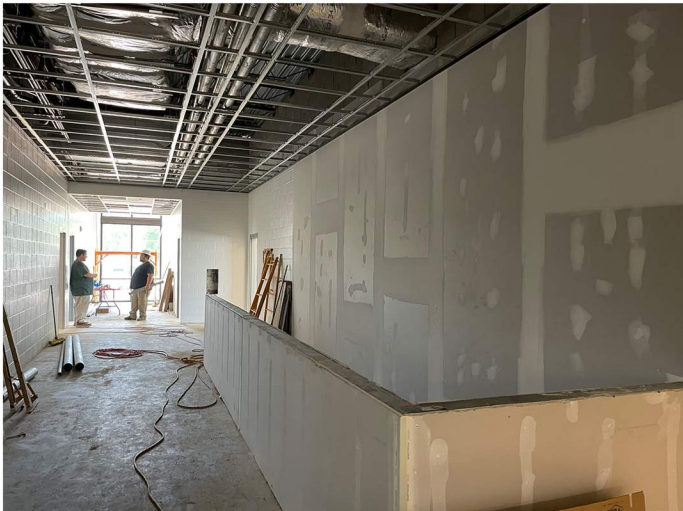
Second level stair landing.