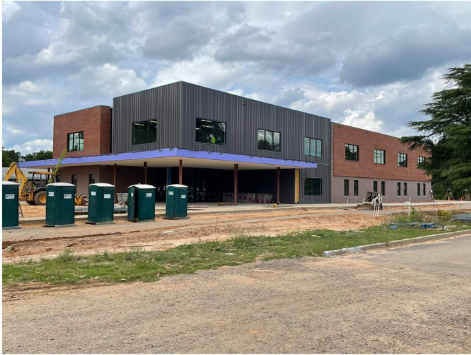
Exterior progress photo.