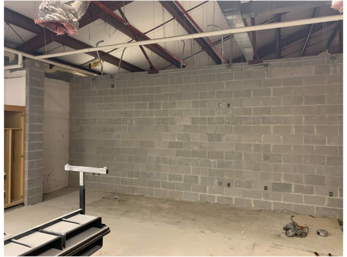
New walls have been constructed in existing kindergarten classrooms.