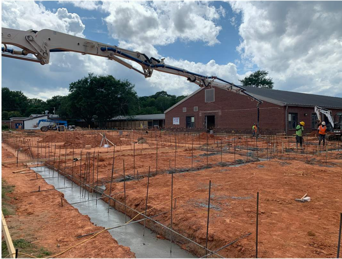
Concrete footings for the new addition are in progress.