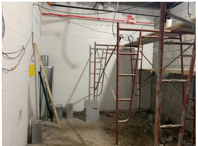
New CMU walls are in progress in Area 2.