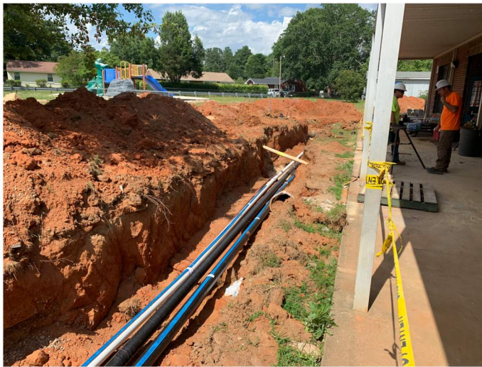
New lines have been installed for new cooling tower.