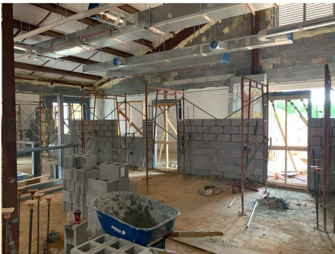
New CMU walls are in progress in Area 1.