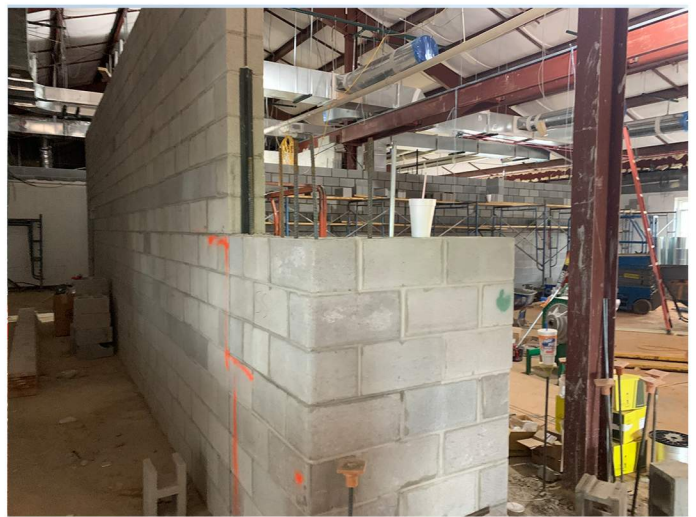
New CMU walls are in progress in Area 1.