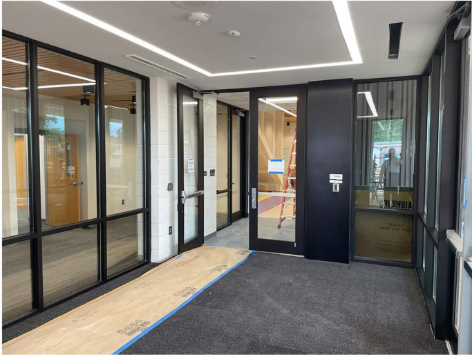
New secure vestibule.