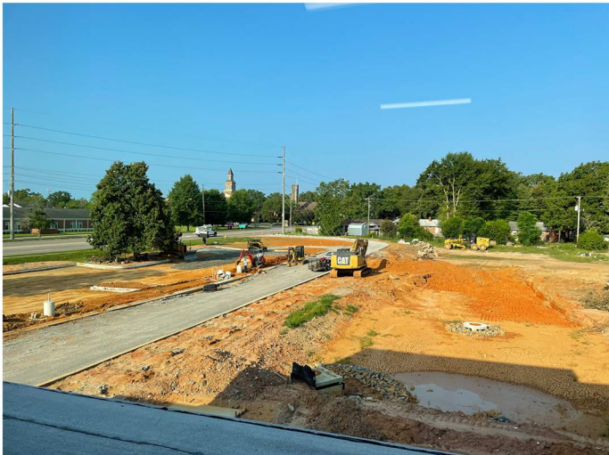
Sitework in progress along E Pine Log Road.