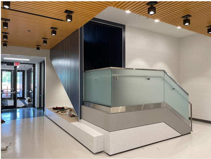
New stair located in addition.