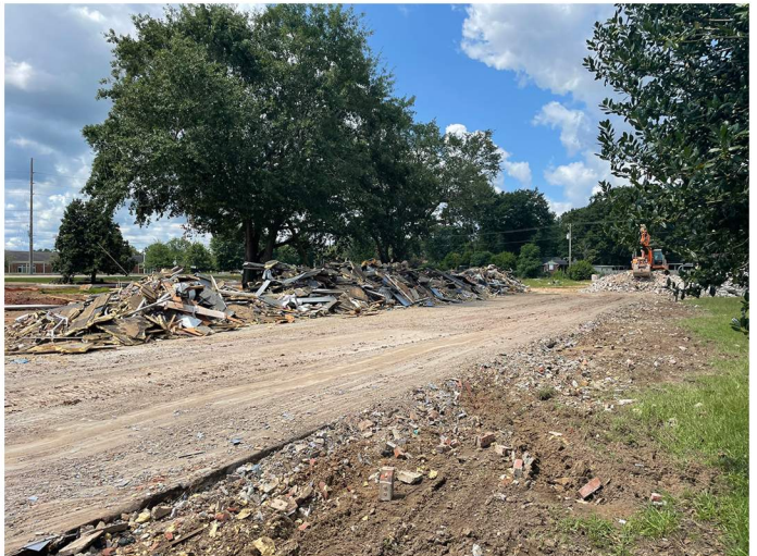
Demolition of (3) existing buildings is complete. (2) remain.