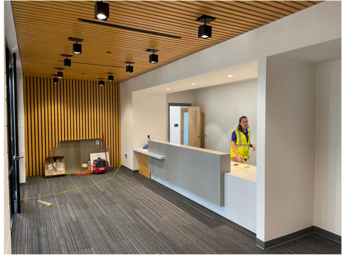
Main lobby / reception.