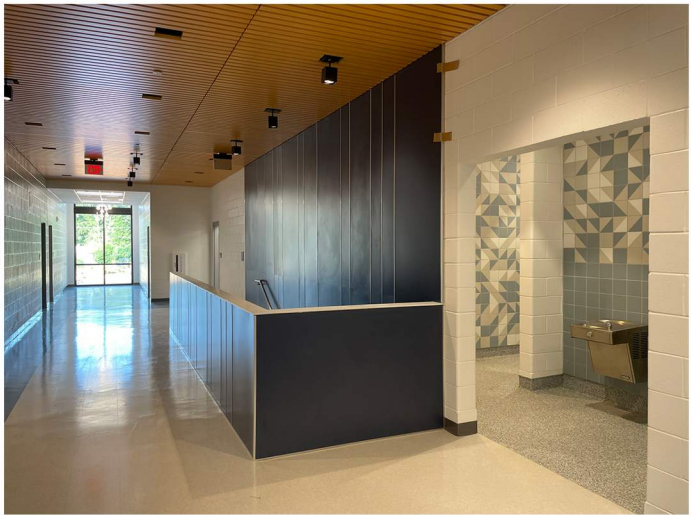
Second level corridor.