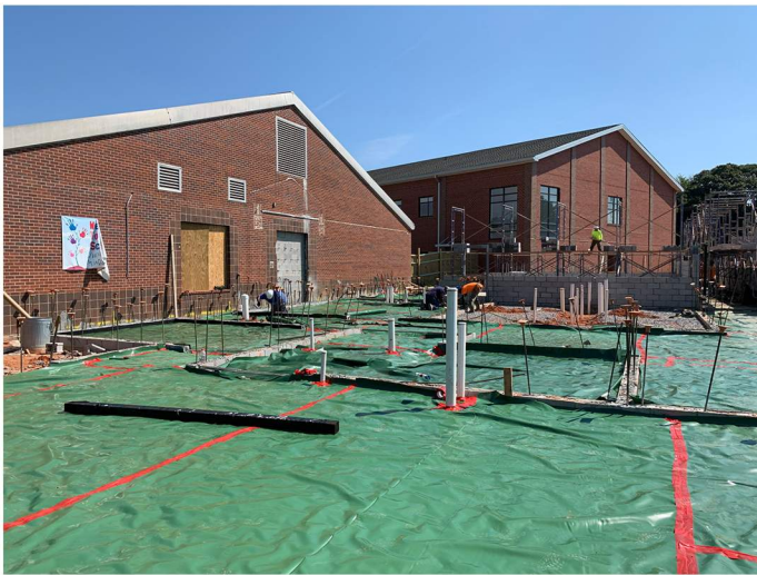
Vapor retarder installation is progress for the next slab pour.