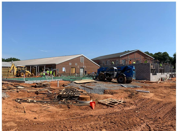
View from the exterior looking at the new addition / building entry.