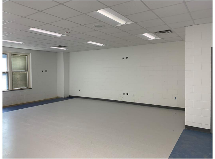
Progress image in renovated classroom in Area 1.