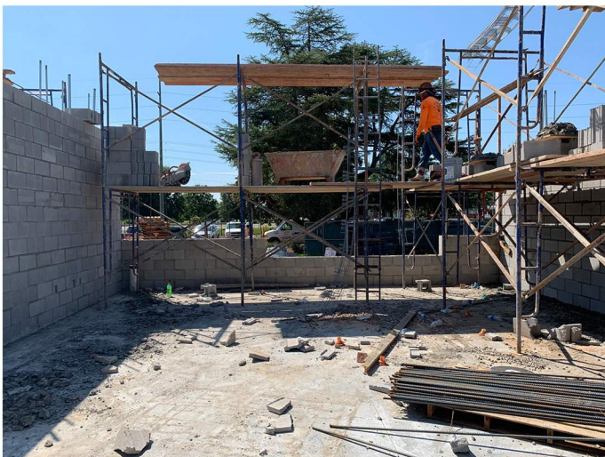
View into typical new classroom in the addition.