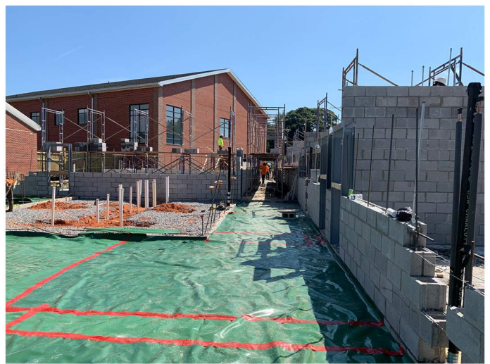
View down new corridor, CMU walls are in progress.