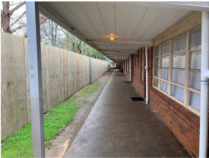
Construction barricades have been installed.