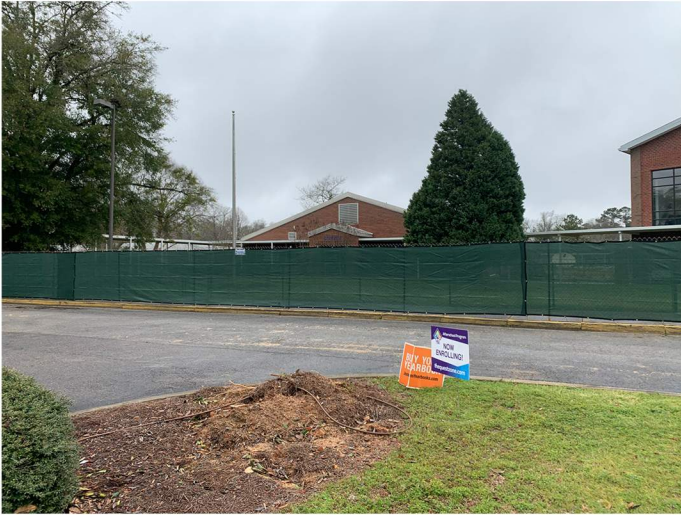
Construction fencing has been installed.