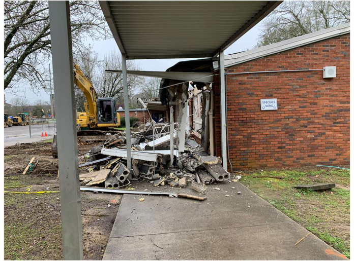
Demolition is underway.