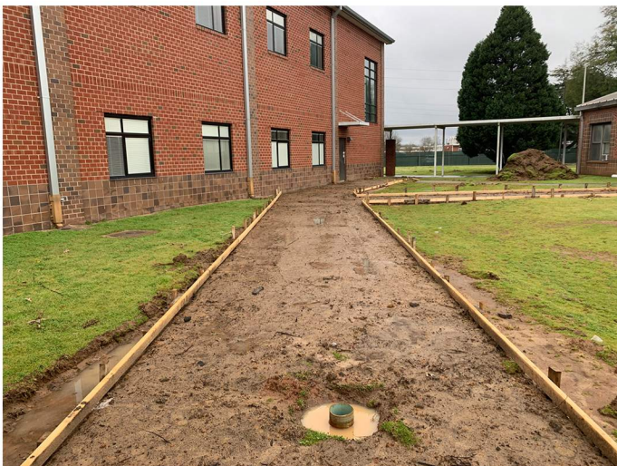
Sitework is underway to support the Phase 1 site conditions.