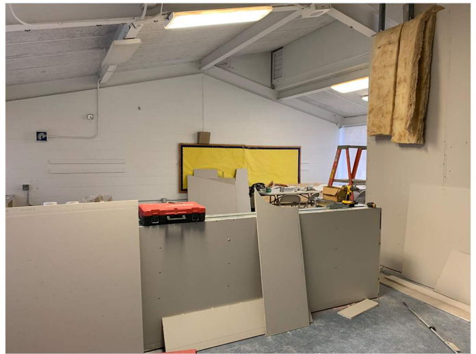
Temporary office space is under construction.