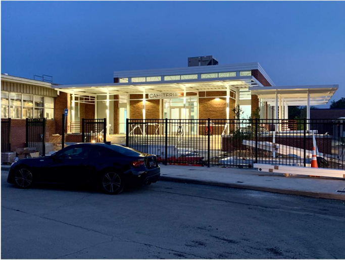
Progress photo of cafeteria addition exterior.