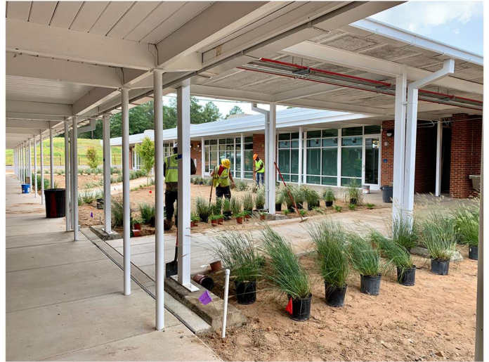
Progress photo of courtyard space between Areas 1 and 2.