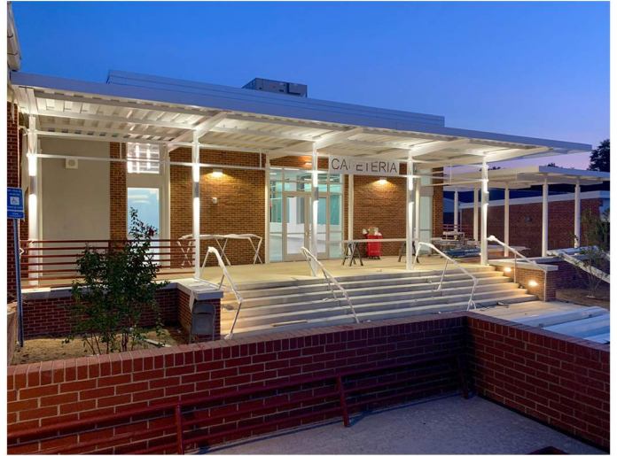
Progress photo of cafeteria addition exterior.