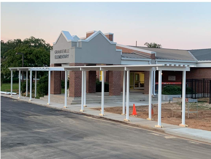
New covered entry walkway and building signage.