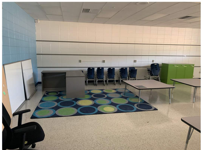
Furniture installation is in progress.