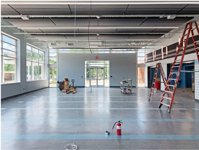
Progress photo of cafeteria addition interior.