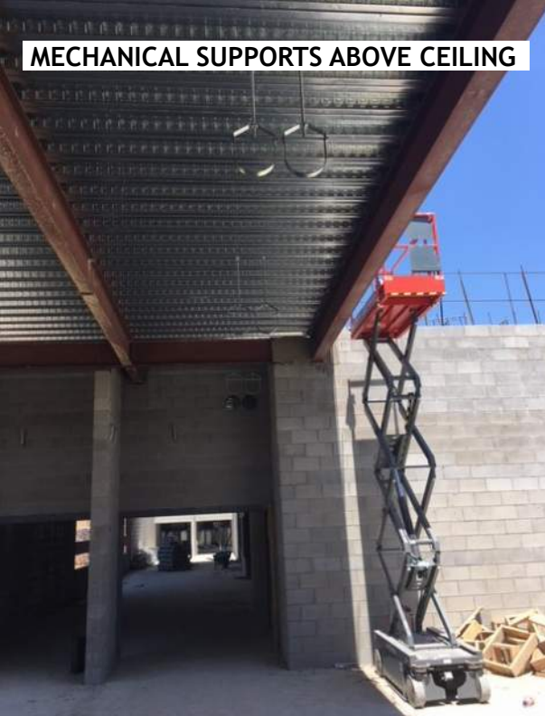
MECHANICAL SUPPORTS ABOVE CEILING