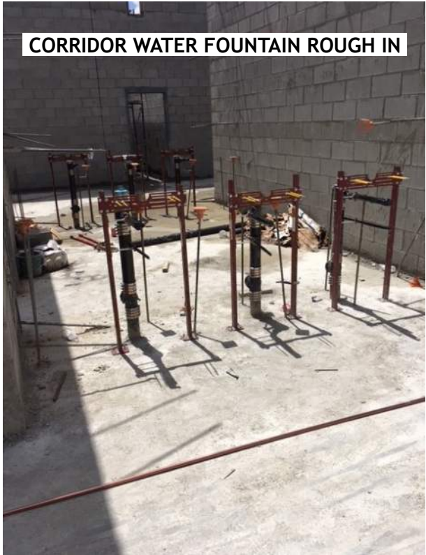
CORRIDOR WATER FOUNTAIN ROUGH IN