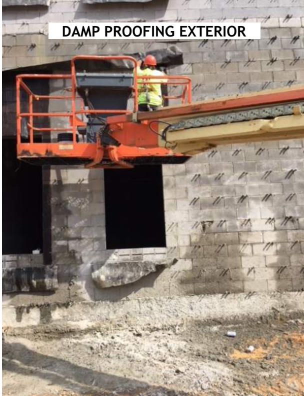
DAMP PROOFING EXTERIOR