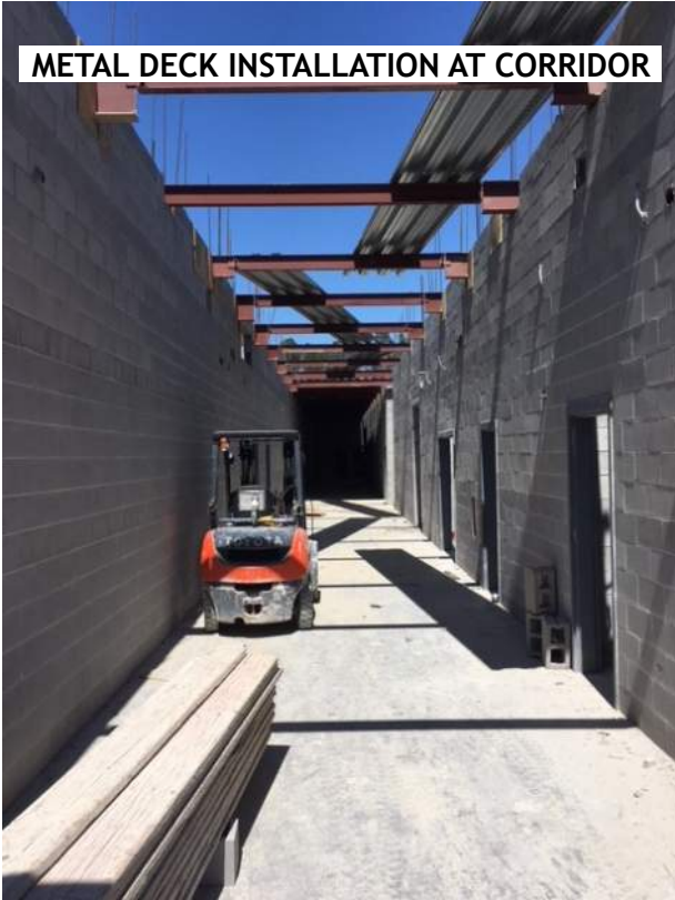
METAL DECK INSTALLATION AT CORRIDOR