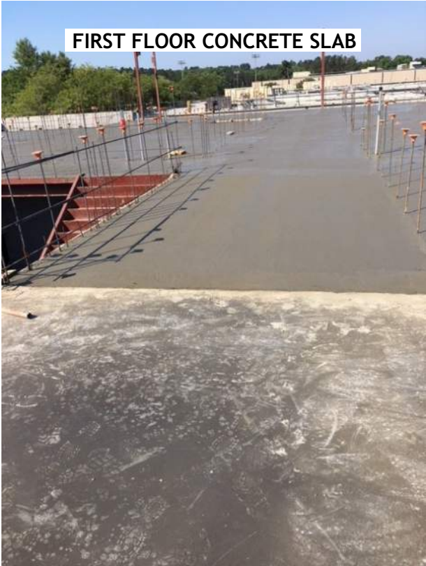
FIRST FLOOR CONCRETE SLAB