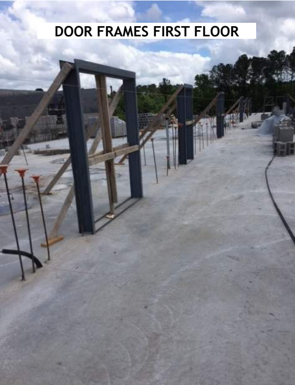
DOOR FRAMES FIRST FLOOR