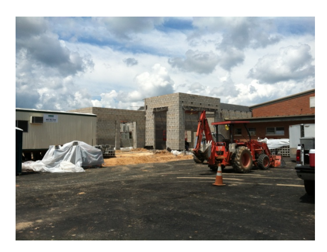
1 – Concrete masonry walls at the north entrance and kitchen are complete.