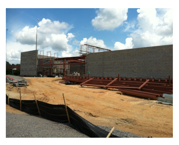
2 – Addition facing Atomic Road. Large opening in the center is for the dining room. Roof steel is ready to set.