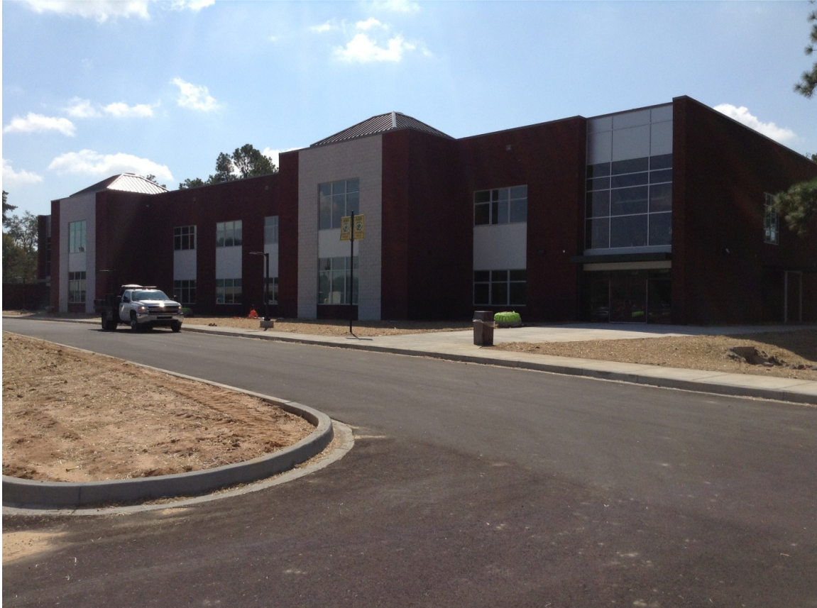
Science Building – Building Exterior, Sidewalks, and Paving