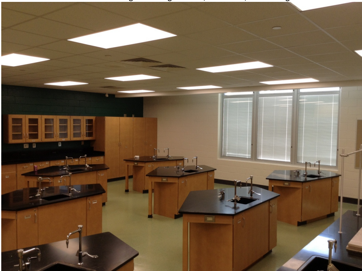
Science Building – Science Lab