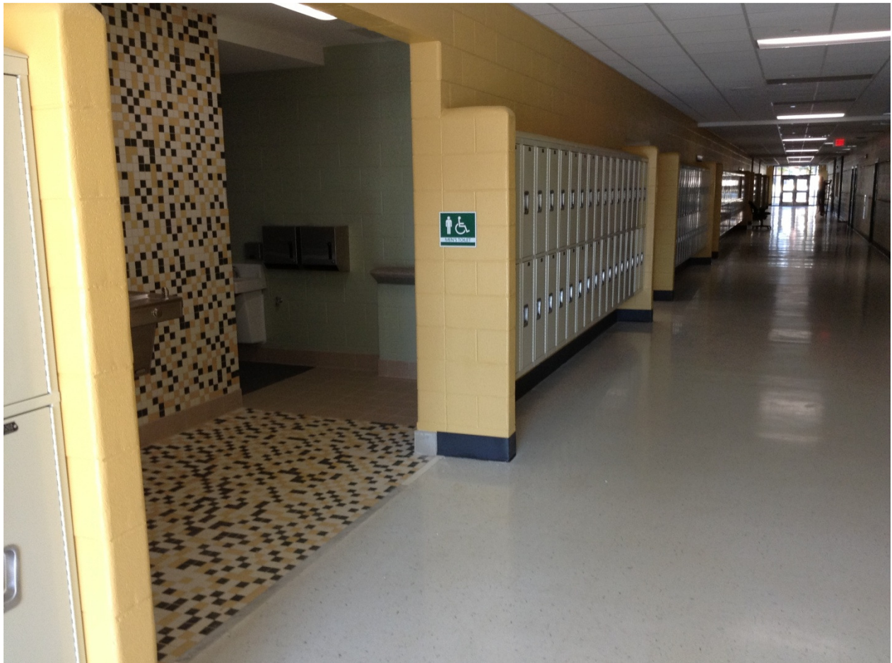
Science Building – First Floor Corridor and Public Restrooms