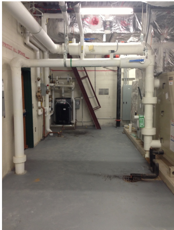
Science Building - Stairwell and Mechanical Room