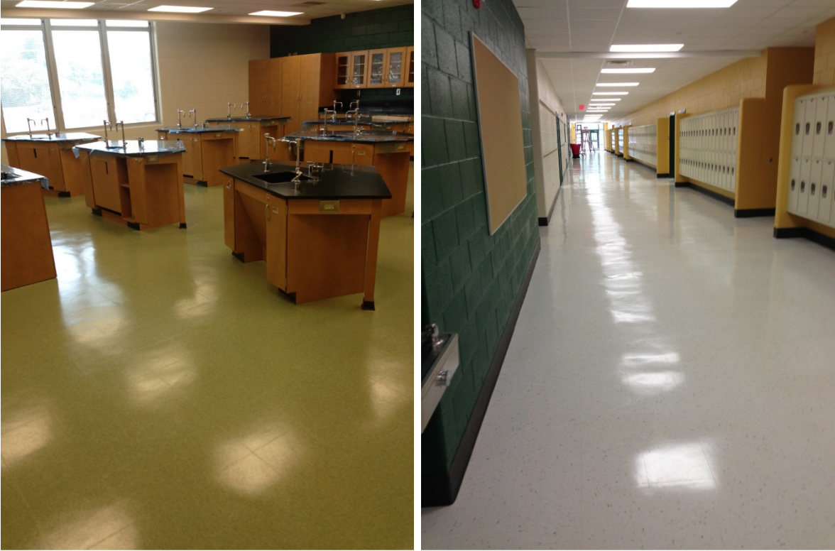
Science Building – Science Lab and Corridor