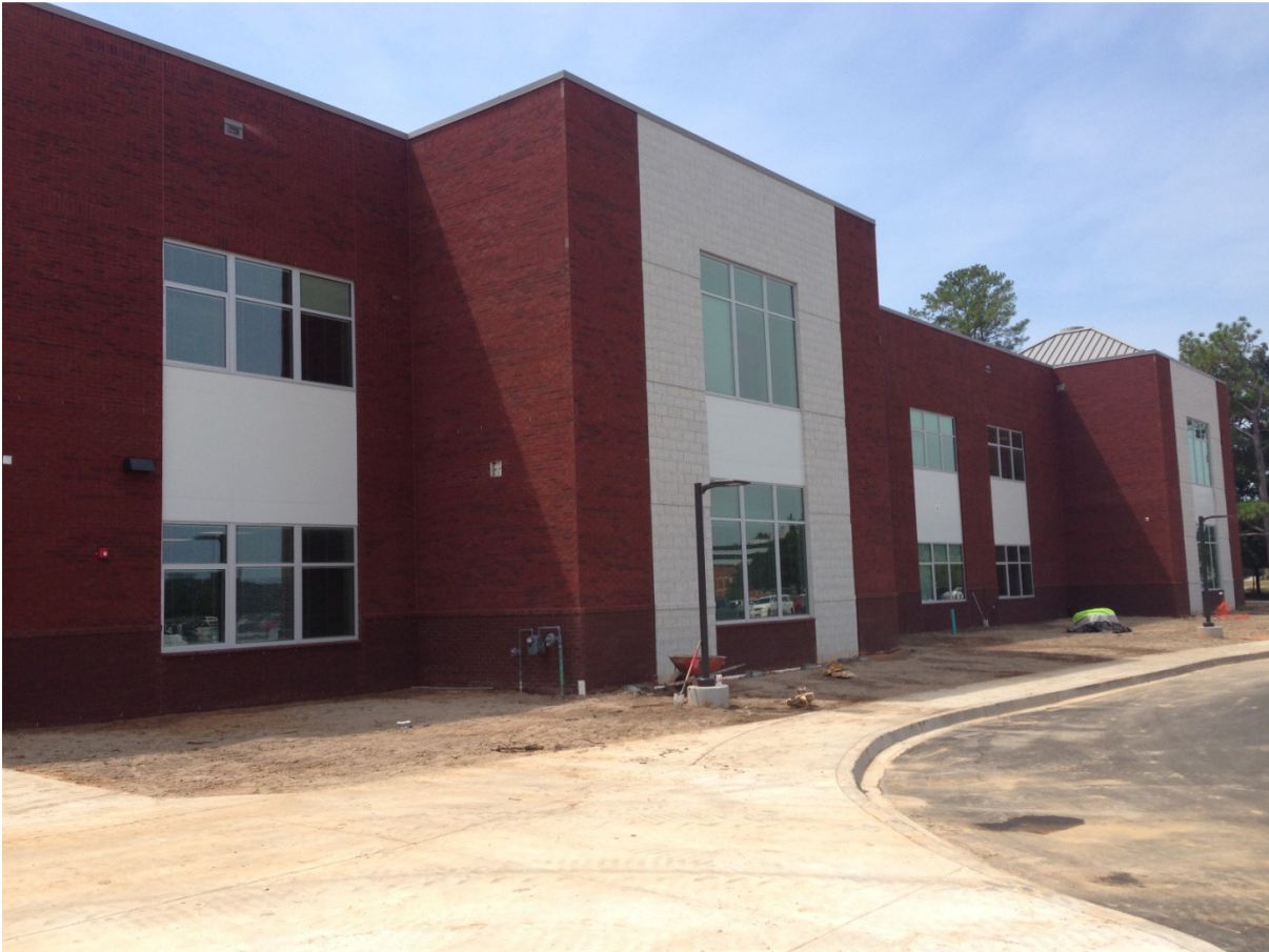
Science Building – Building Exterior and Sidewalk