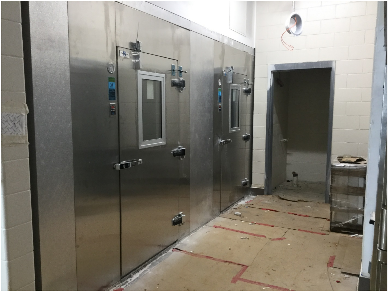
Freezers installed at culinary.