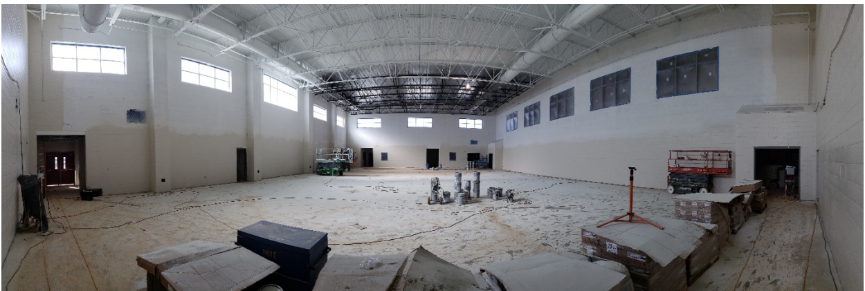
Painting underway at Auxiliary Gym.