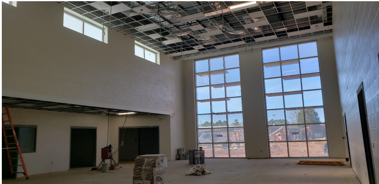
Interior of Band room. Ceiling grid and first coat of paint complete.