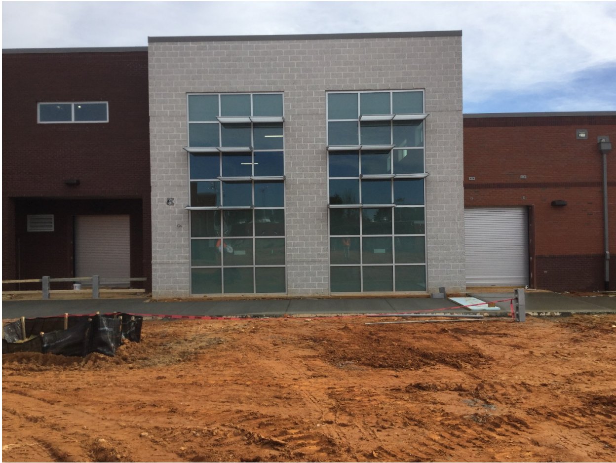
Exterior elevation of Band Room.