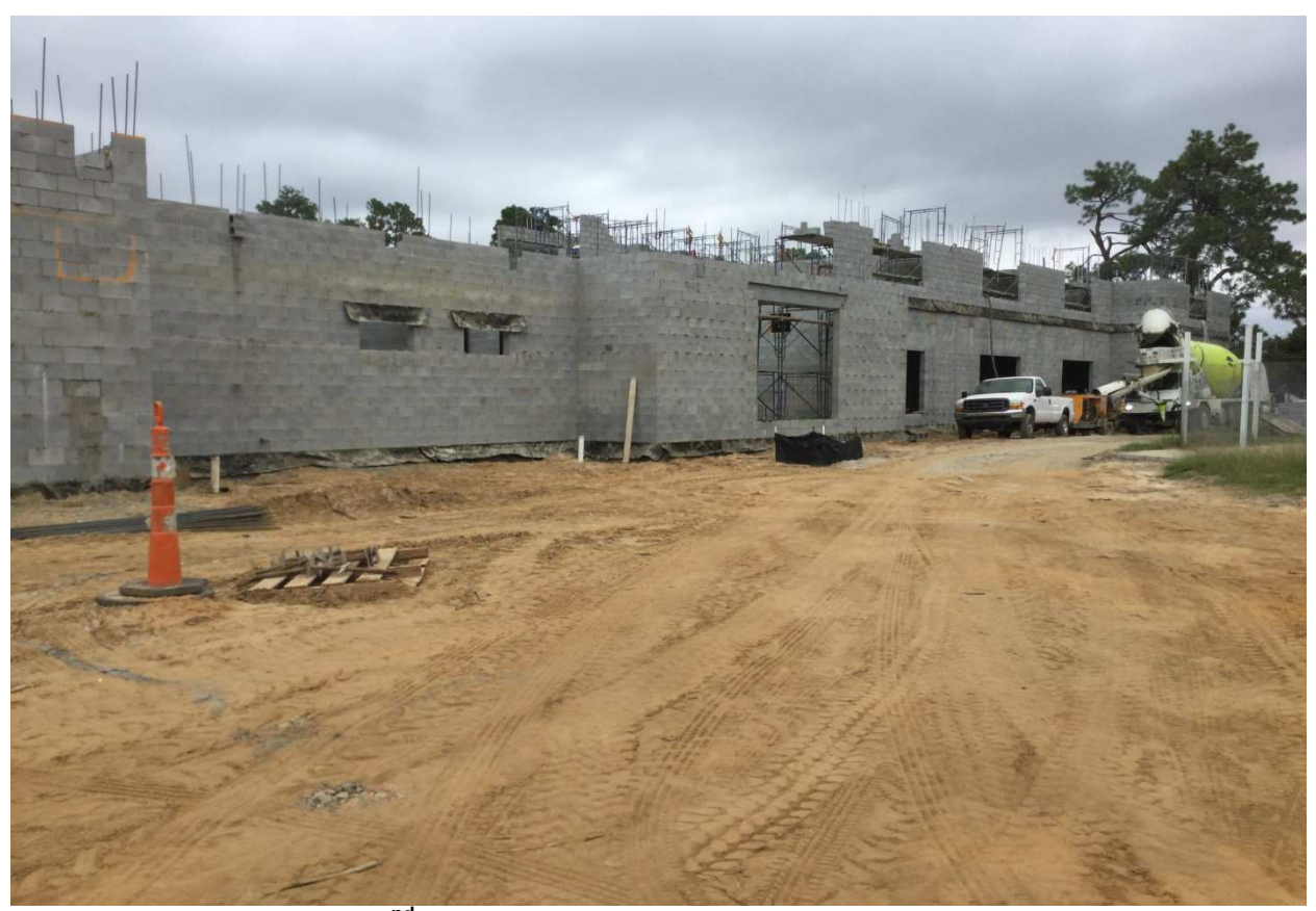
2<sup>nd</sup> floor CMU walls underway at area A