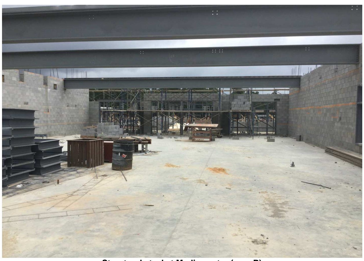
Structural steel at Media center (area B)