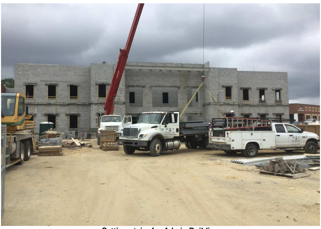
Setting stairs for Admin Building