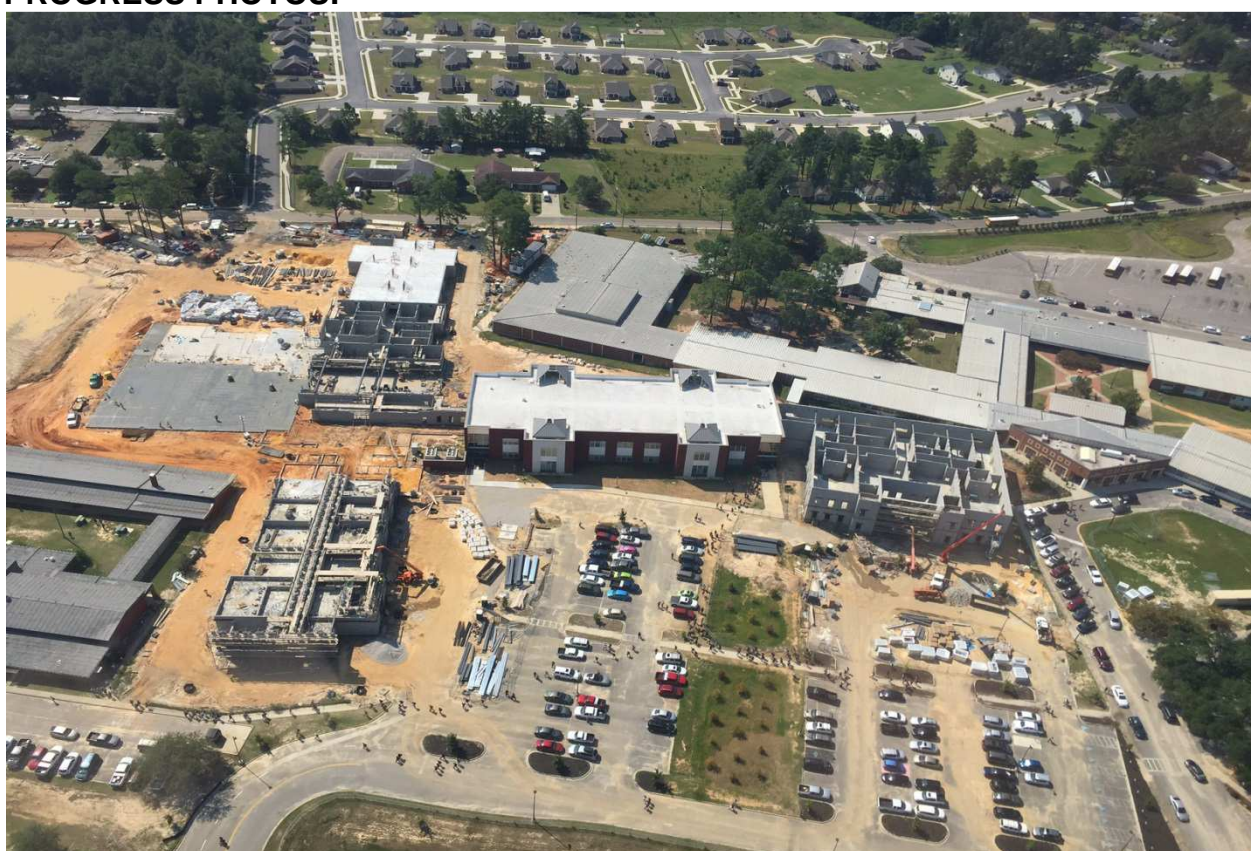
Aerial Photo of Site taken on 09/08/16