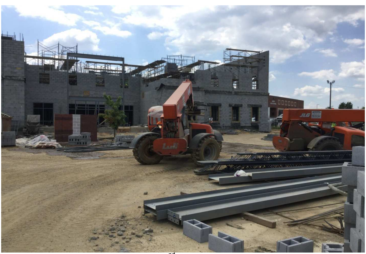
Main entrance and 2<sup>nd</sup> floor CMU walls at area E