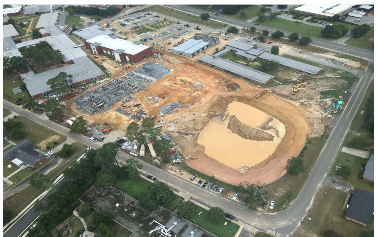
Aerial Photo of Site taken on 08/05/16