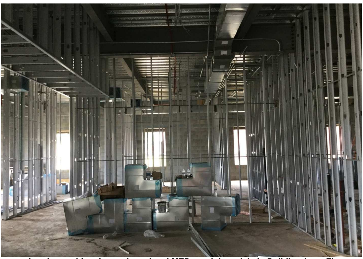
Interior stud framing and overhead MEP rough in at Admin Building (area E)