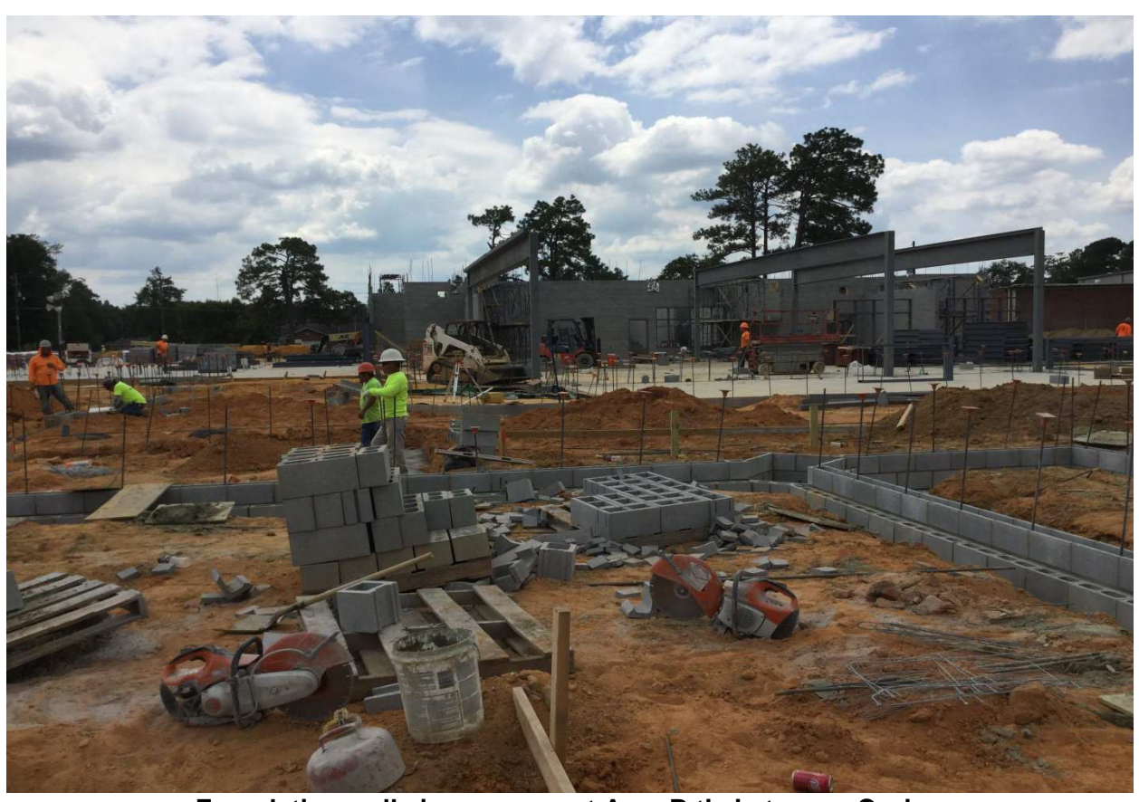
Foundation walls in progress at Area B tie in to new C wing