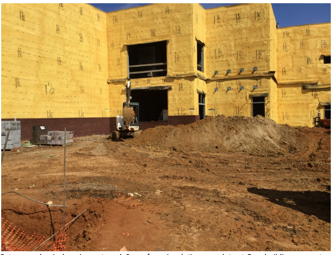
Future mechanical equipment yard. Spray foam insulation complete at Gym building connector.