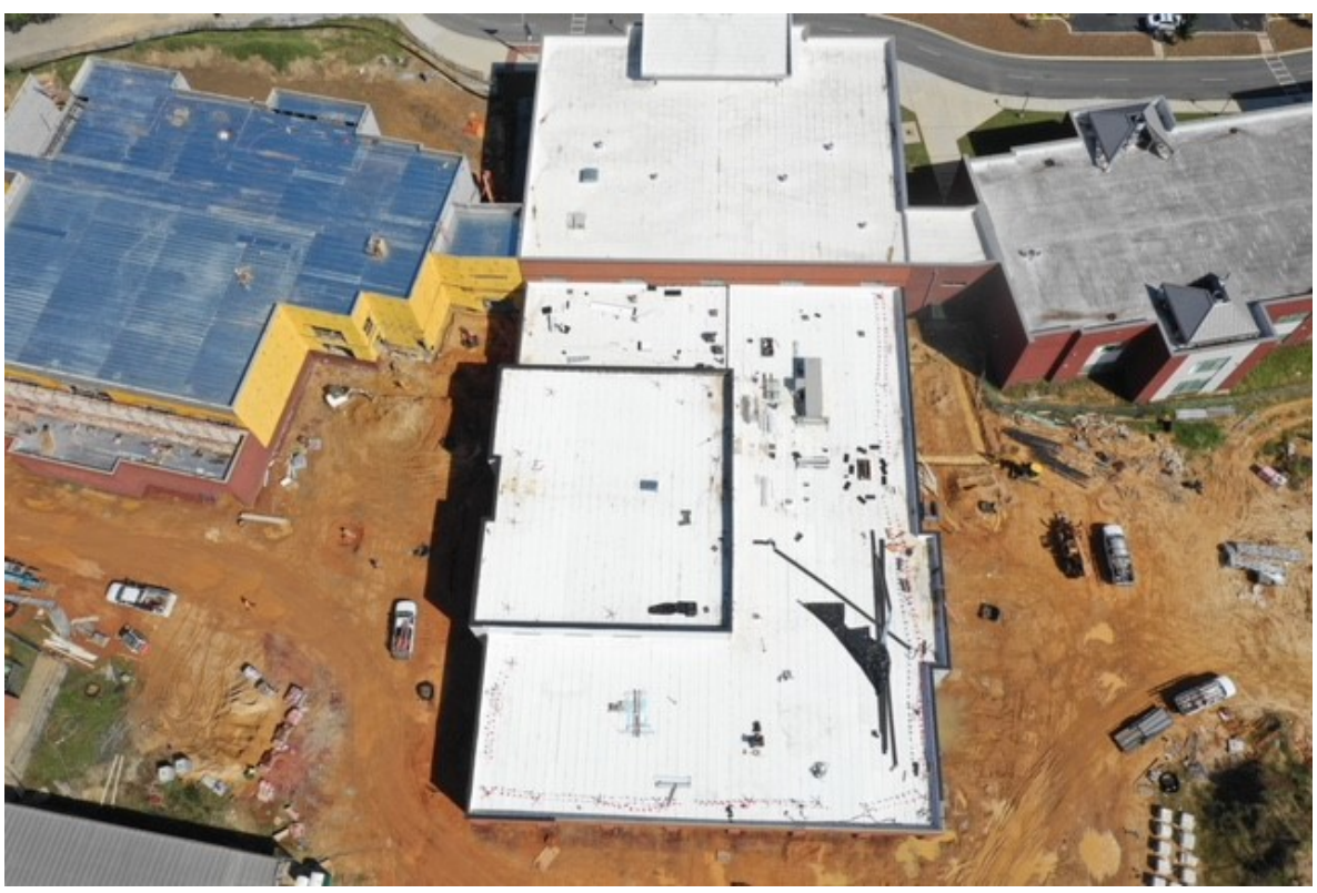
Temporary roof dry in at ROTC/Band building. Steel deck on Gym Building.