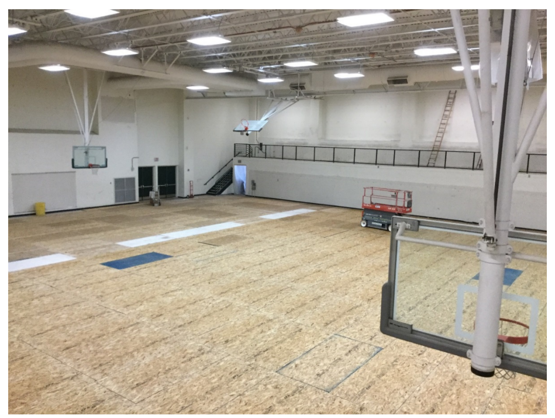
Old bleachers removed. Floor protected while performing new overhead rough-ins.