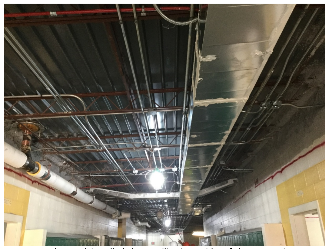
New ductwork installed above ceiling in corridor of classroom wing.