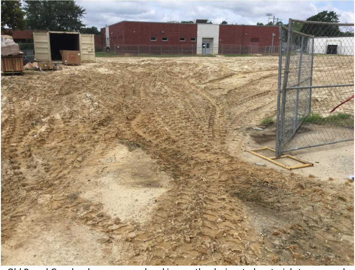
Old Barrel Gym has been removed and is now the designated material storage yard.