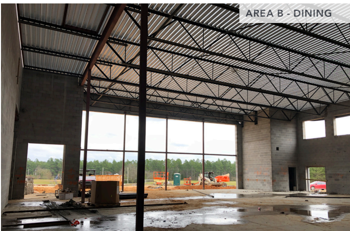
AREA B - DINING