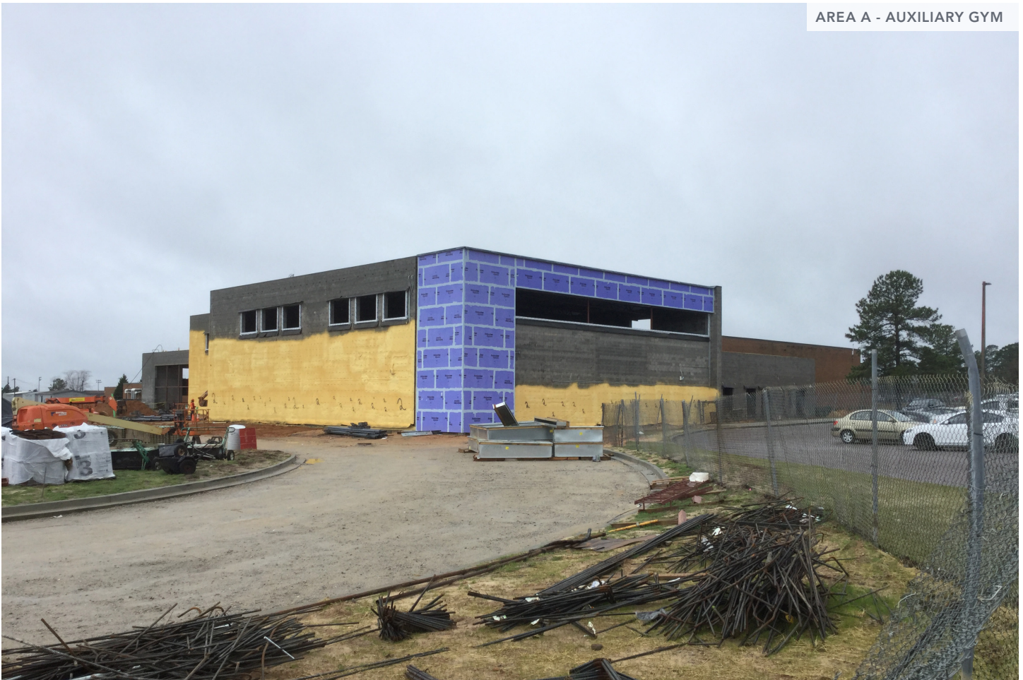
AREA A - AUXILIARY GYM