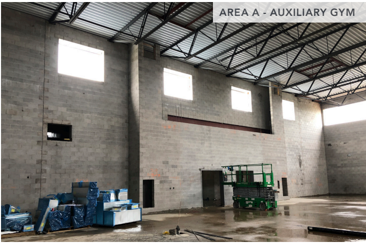
AREA A - AUXILIARY GYM