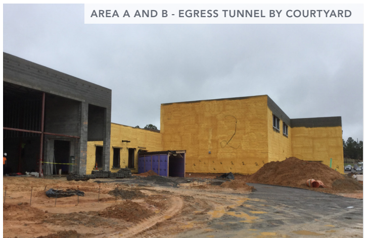
AREA A AND B - EGRESS TUNNEL BY COURTYARD