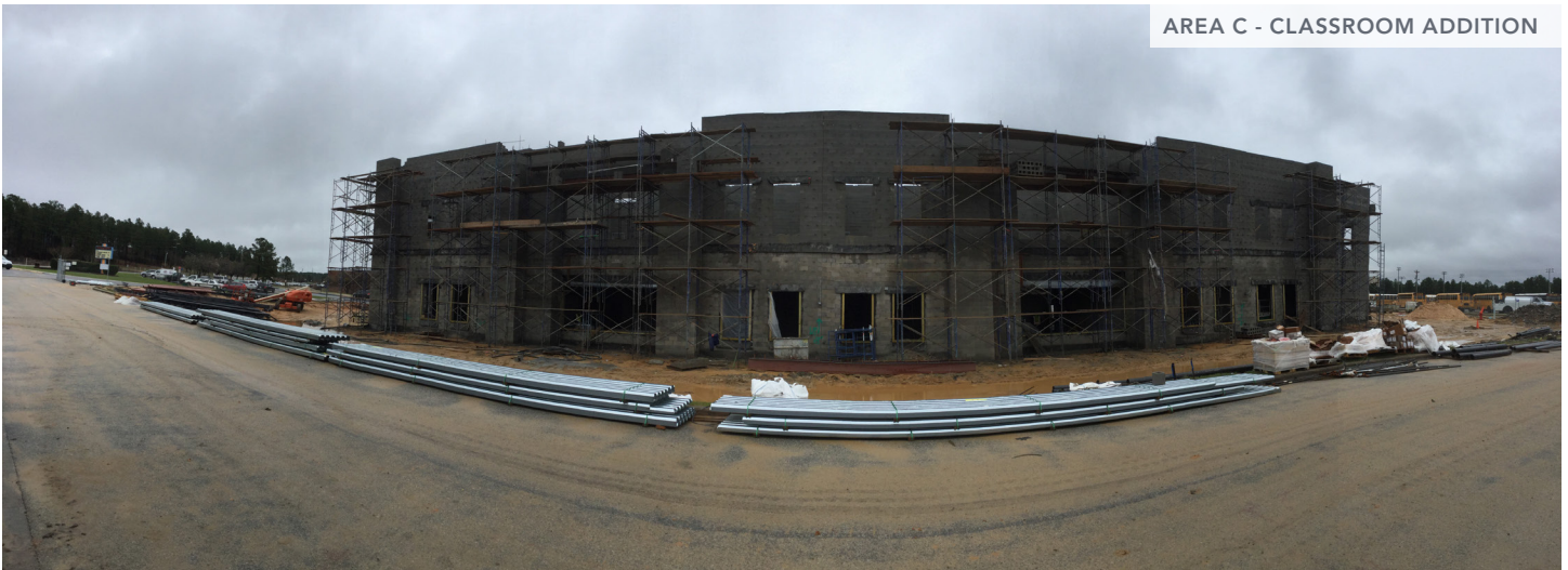
AREA C - CLASSROOM ADDITION