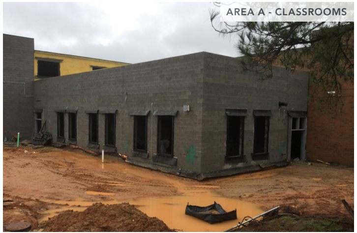
AREA A - CLASSROOMS