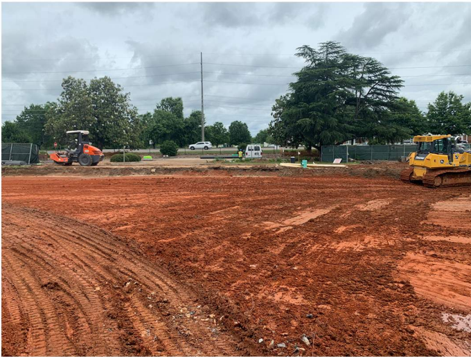
The building pad is in progress.