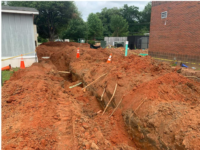
Utility work in progress.