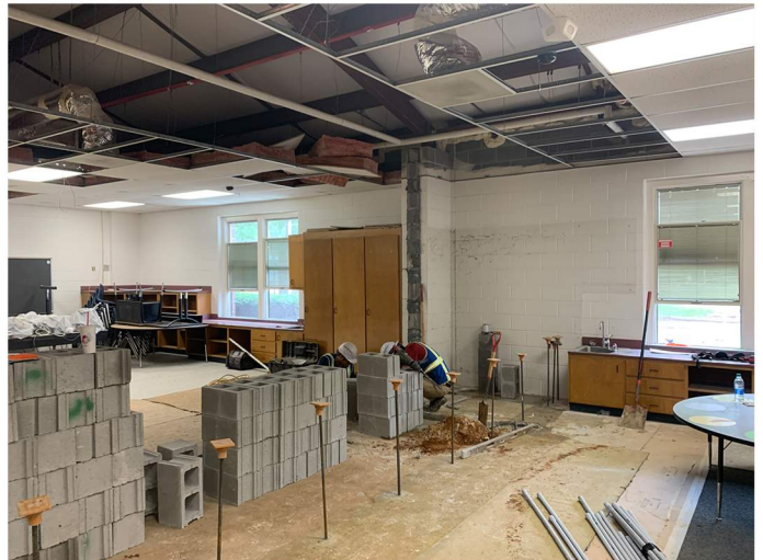
New wall in progress in expanded kindergarten classroom.