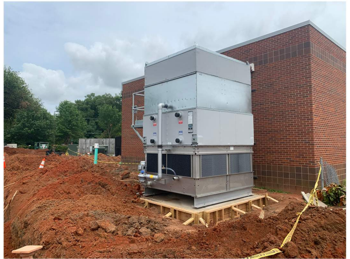
New cooling tower has been set.