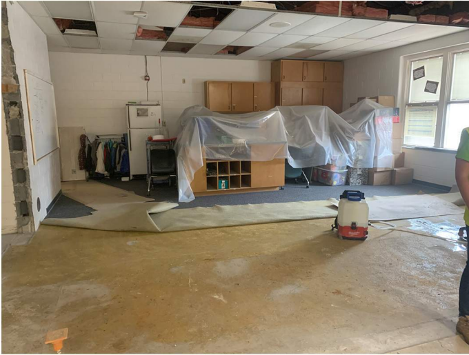
Wall demolished in kindergarten classroom.