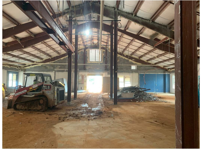
Demolition complete in new media center area.