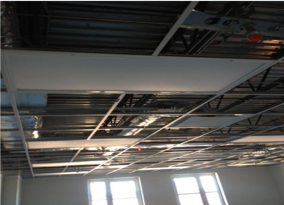
ceiling grid being installed