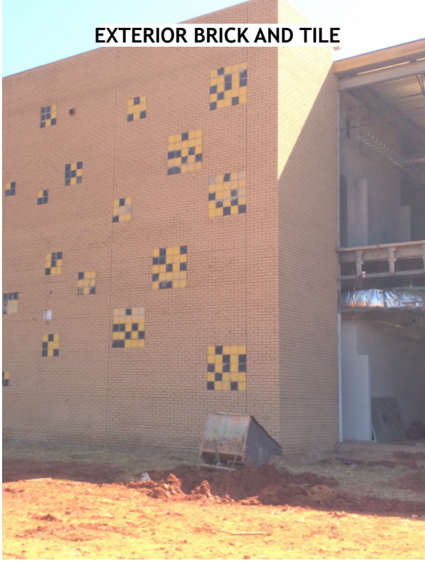
EXTERIOR BRICK AND TILE