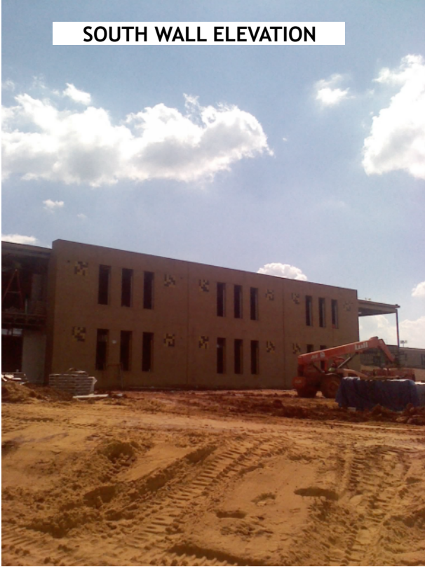
SOUTH WALL ELEVATION