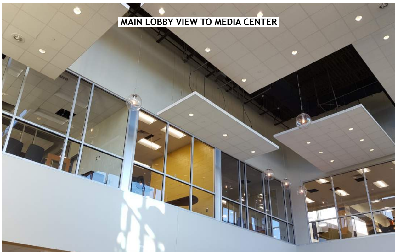
MAIN LOBBY VIEW TO MEDIA CENTER