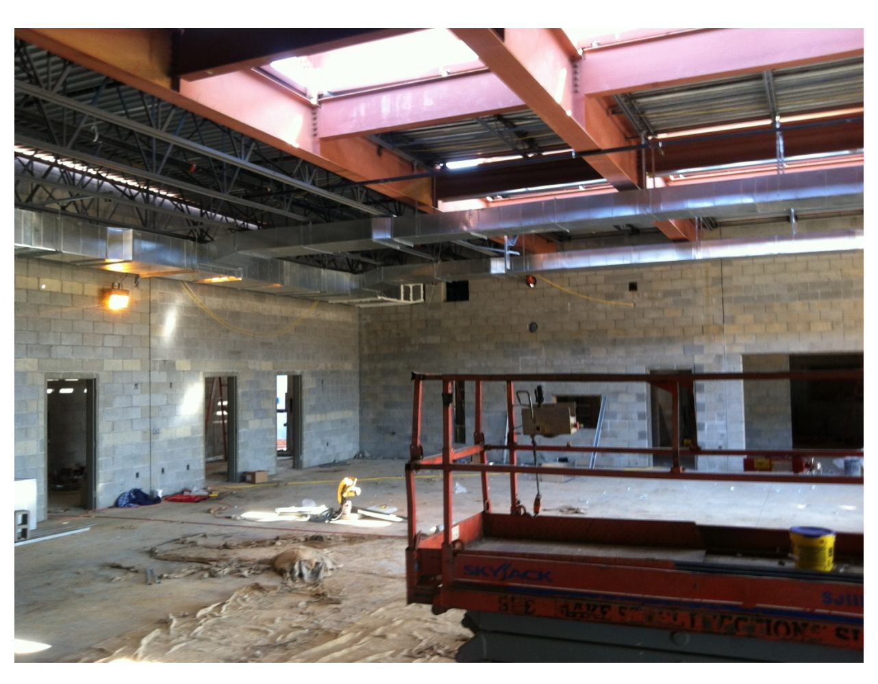
2 – Dining Room interior. Roof monitors admit light deep into the building, as visible in photo. Supplemental construction lighting has not been necessary.