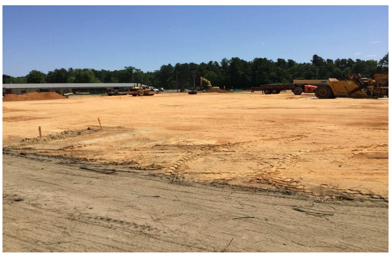
Building pad backfill at Cafeteria