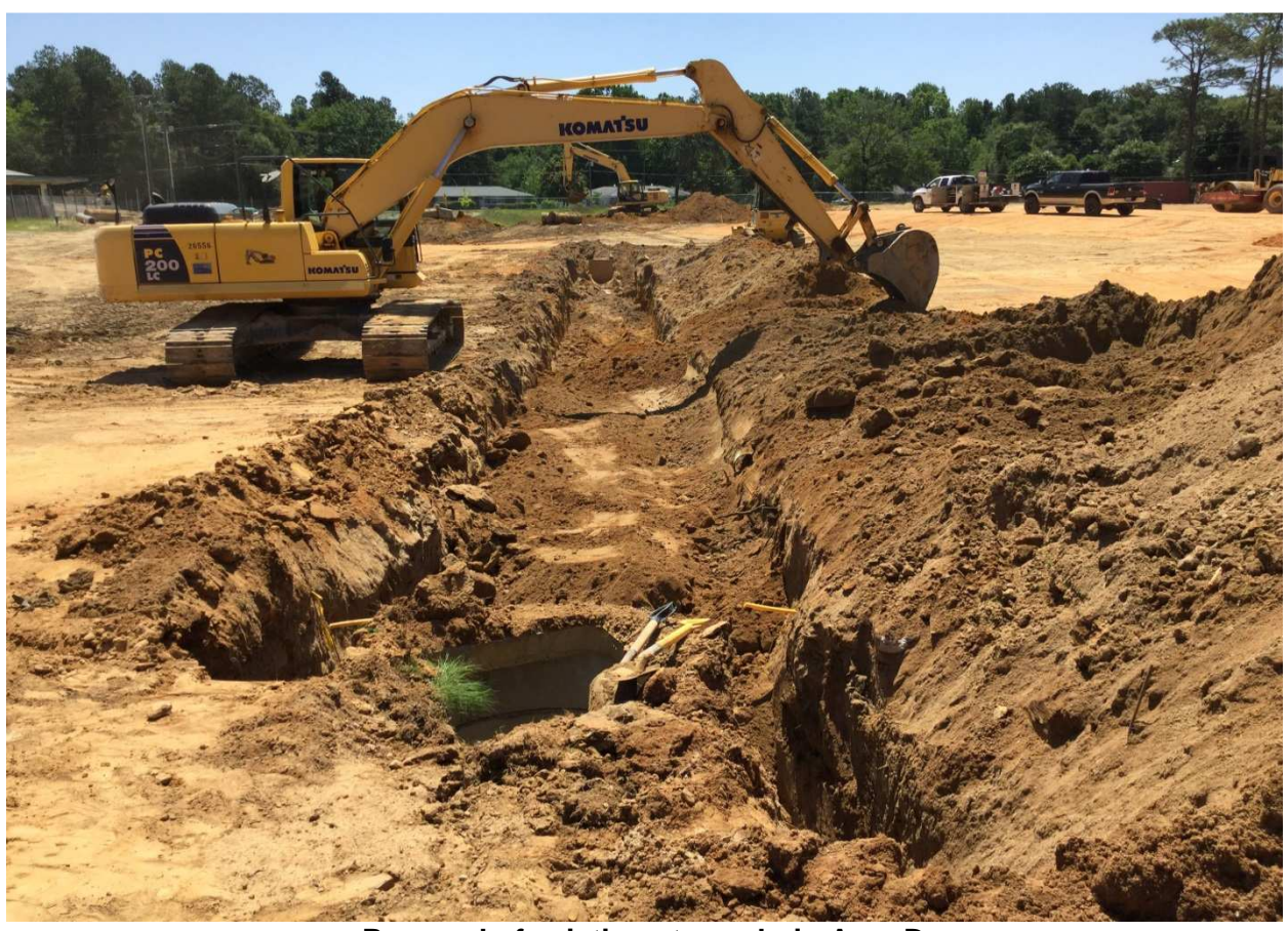
Removal of existing storm drain Area D