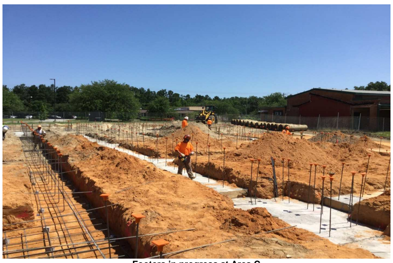
Footers in progress at Area C