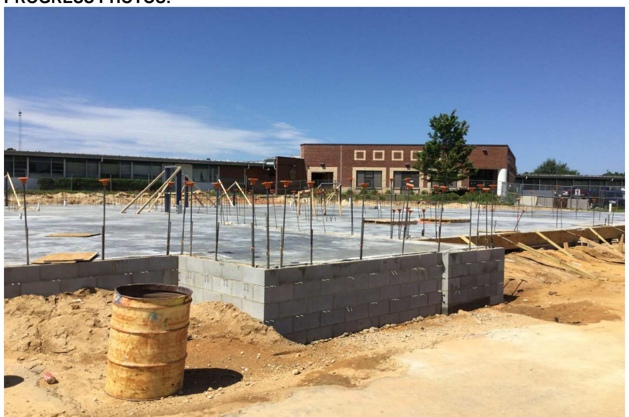
Foundation wall and slab on grade Admin Building