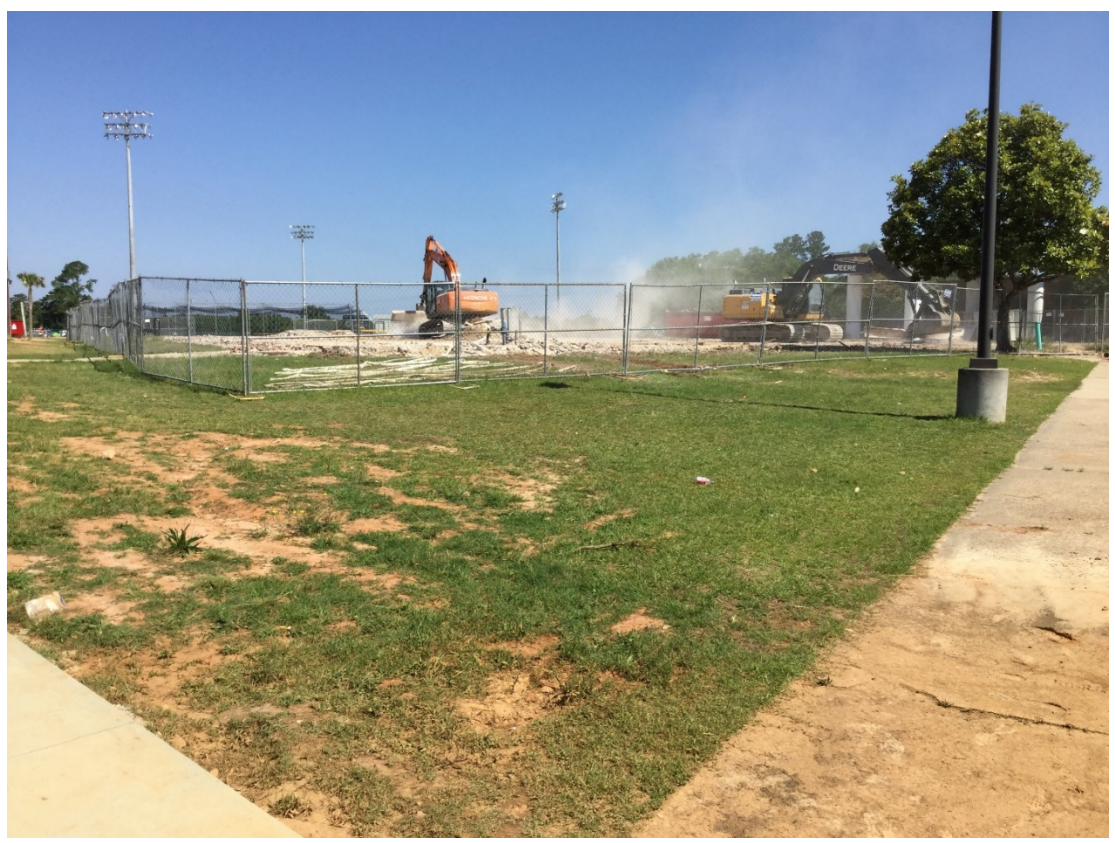
Removal of old Barrell Gym as part of remaining scope of Phase 2B project.