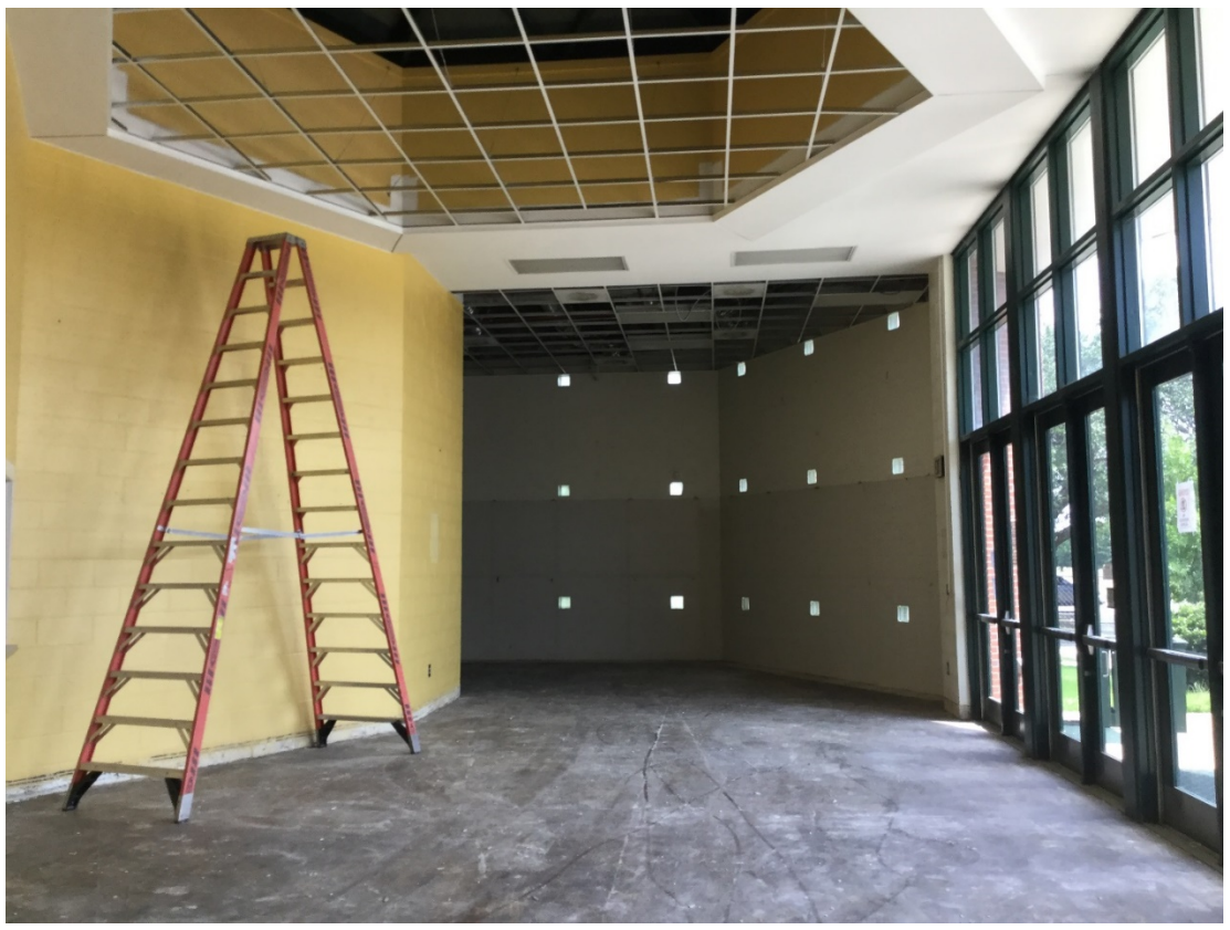
Existing finishes removed at front lobby.