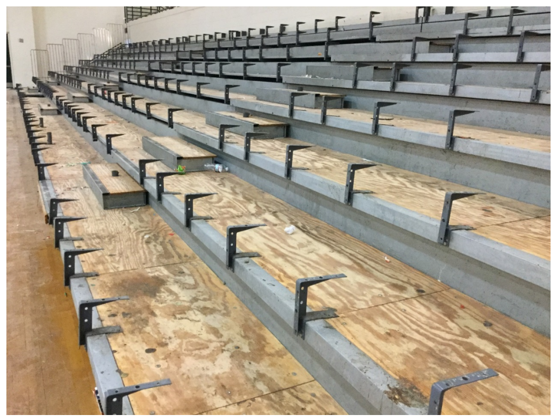
Removal of bleachers underway.