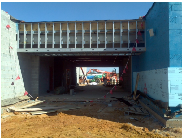
Connector between Area A and Area B