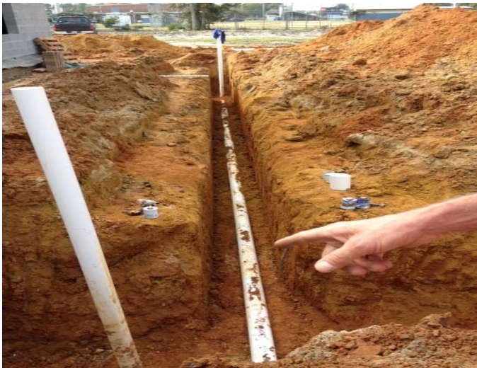
Plumbing line connection @ north end of Area B