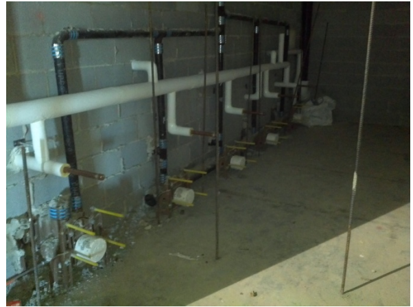
Plumbing rough-in at group toilets.