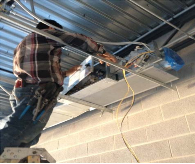
VAV Box installation