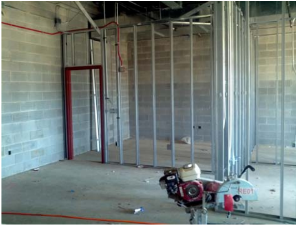
Stud framing in Admin Area