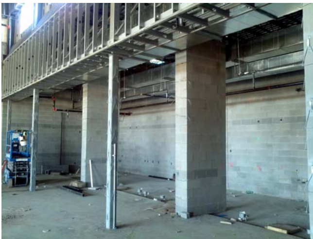
Serving line: framing and sprinkler lines