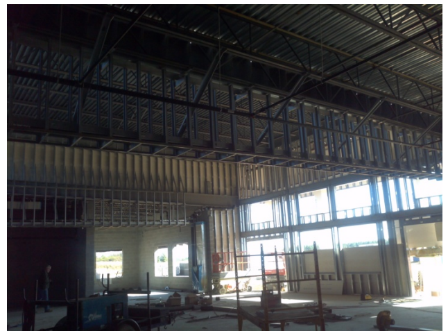
Stud framing in cafeteria.