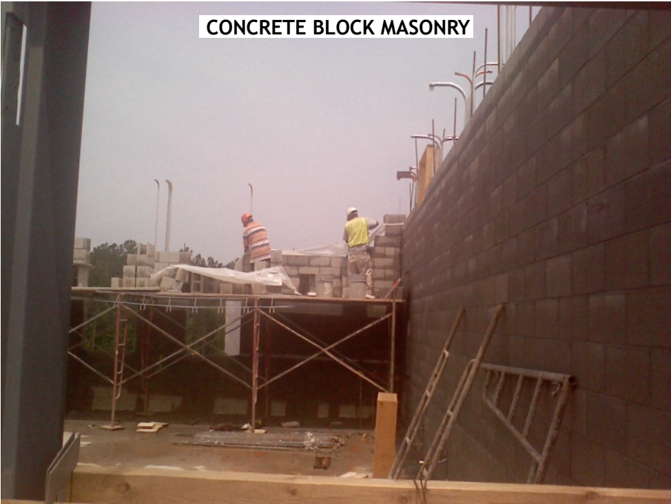
CONCRETE BLOCK MASONRY