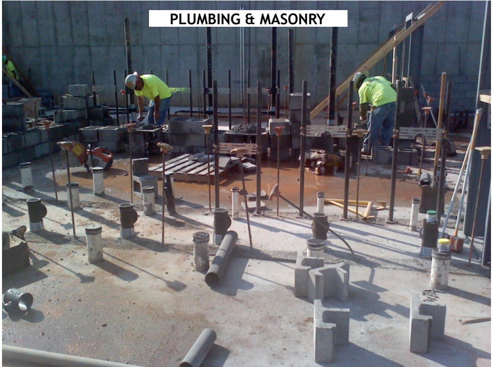
PLUMBING & MASONRY