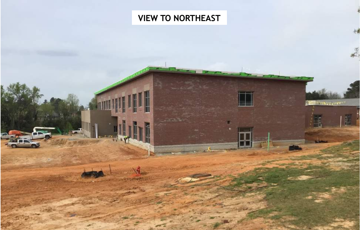
VIEW TO NORTHEAST