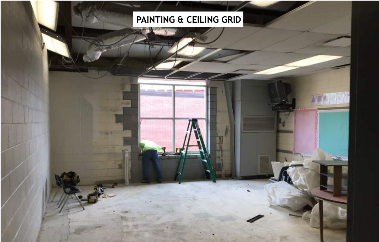
PAINTING & CEILING GRID