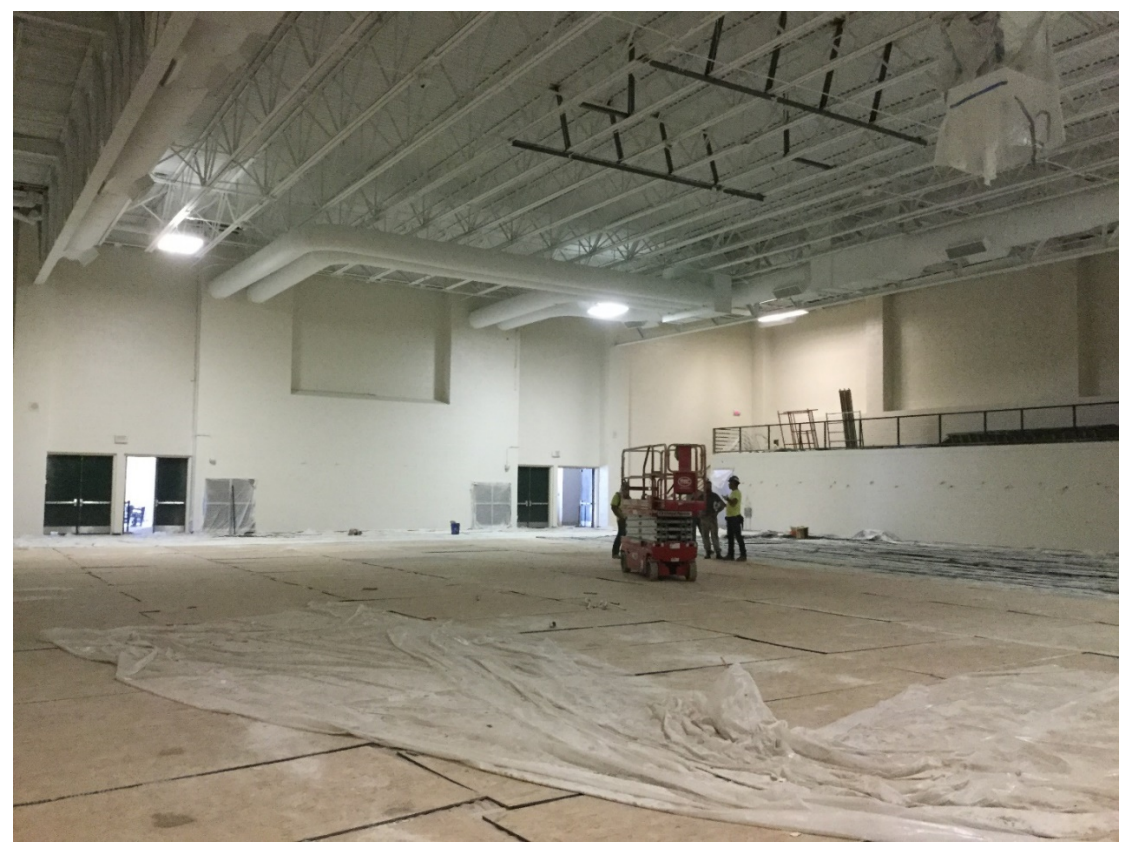
Repainting gym ceiling and ductwork.