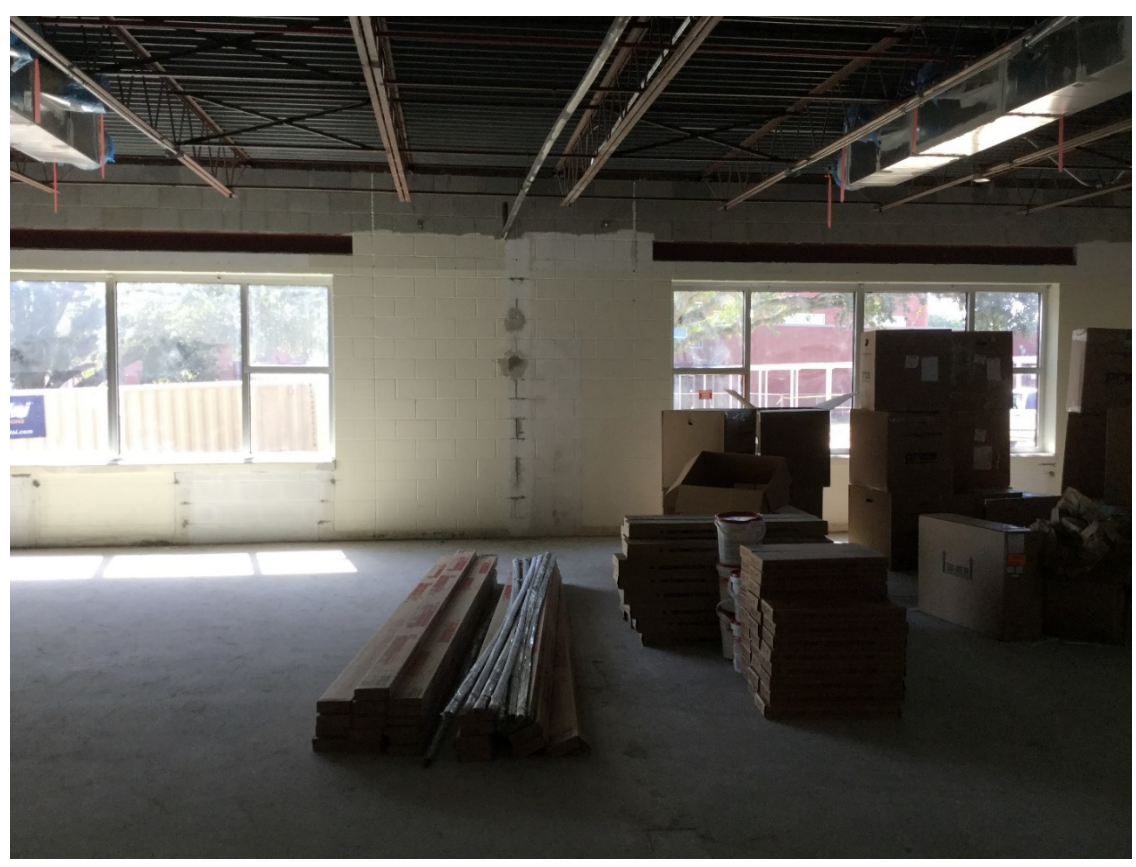
Rough-ins complete at classroom. Stored material for acoustical ceilings and gypsum walls.