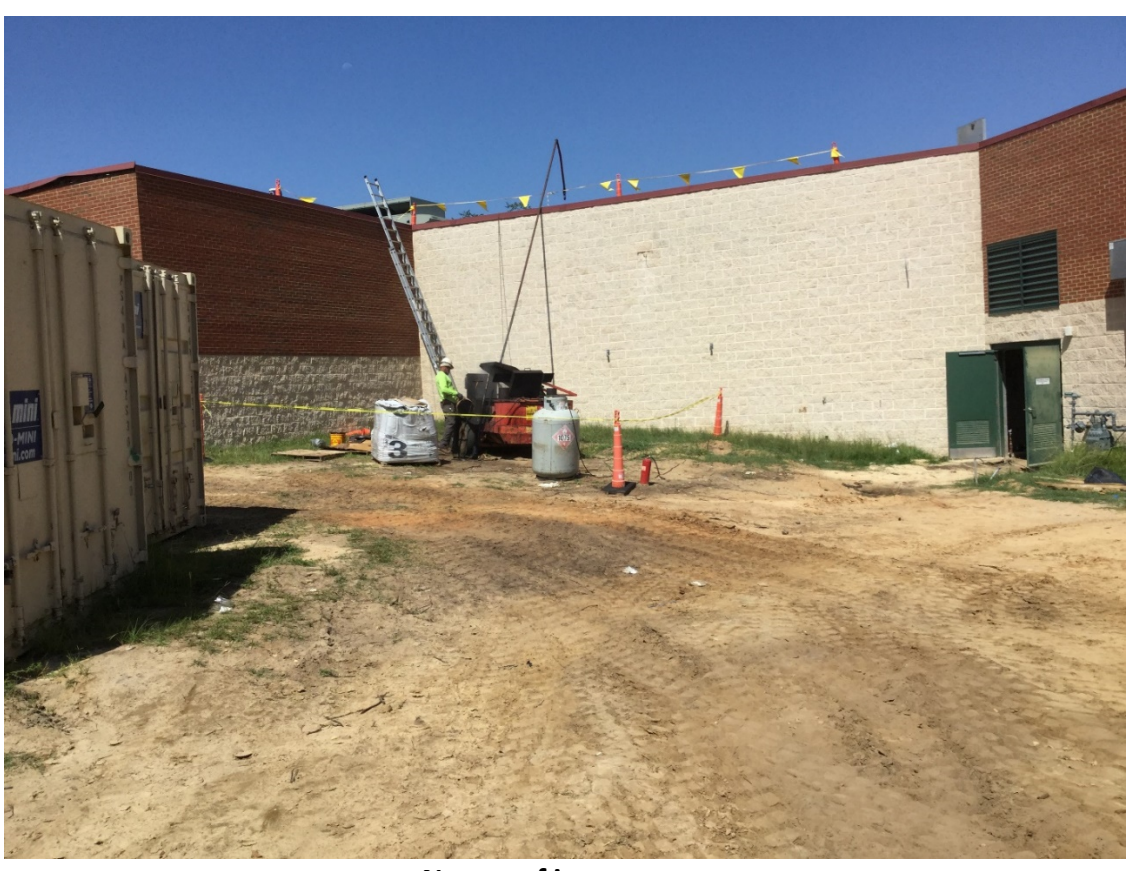
New roof in progress.