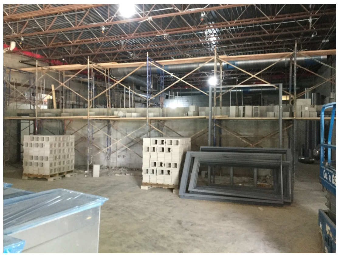
New wall separating weight room and wrestling is in progress.