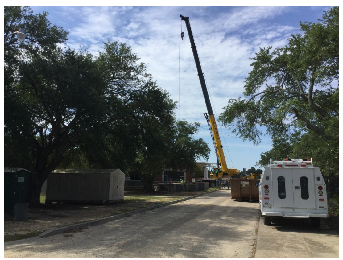
Setting some roof top mechanical units underway