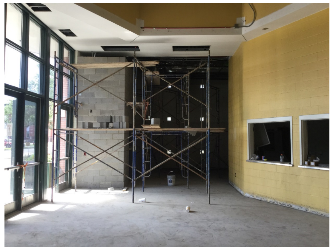
Walls for new ticket booth near complete.