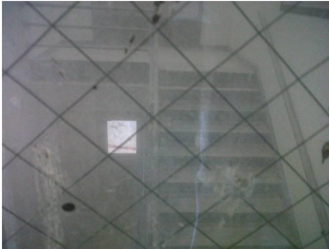
Concrete Removal at Existing Stair