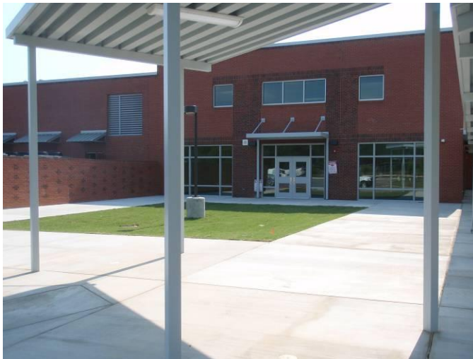
Bus Loop Canopy and Entry