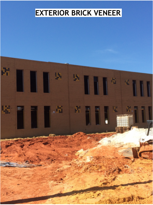
EXTERIOR BRICK VENEER