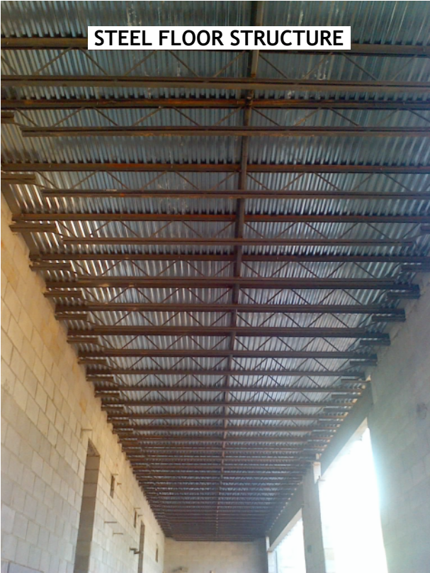
STEEL FLOOR STRUCTURE