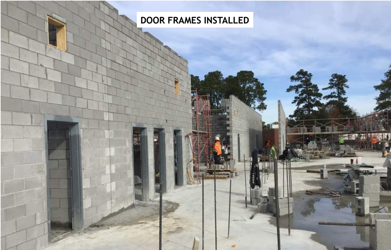
DOOR FRAMES INSTALLED