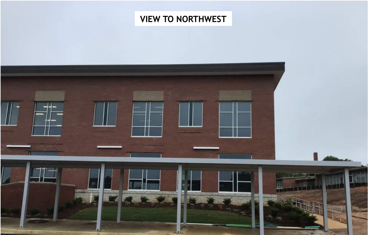
VIEW TO NORTHWEST