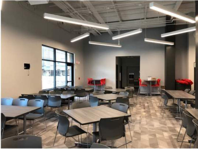
New Dining Area