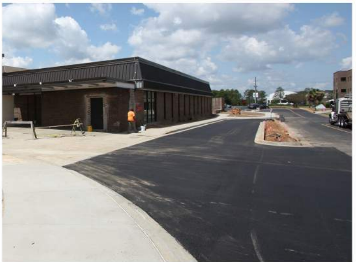
Newly paved drop-off loop