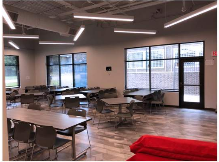
View of Dining Area