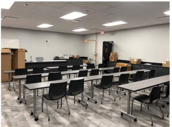
New Science Classroom / Lab